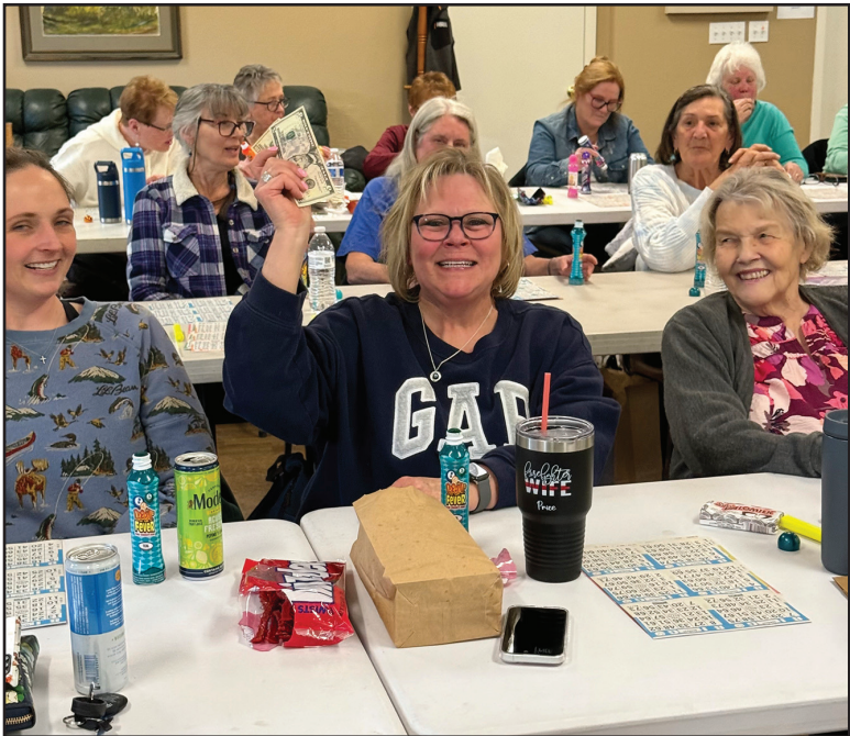
First winner of the night!