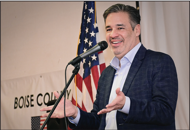
Idaho's Attorney General Raúl Labrador as keynote speaker.