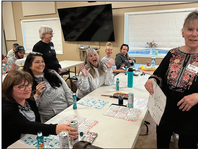
Another winner on a busy night of bingo!

Are you pregnant and not sure what to do next? It's important to confirm your pregnancy before making any decisions. Schedule a free and confidential appointment at one of our Path clinic locations. Or visit Wee One's Wardrobe in Horseshoe Bend to access free baby clothes, diapers, baby accessories, and maternity clothing. Visit our website at treasurevalleypath.org or call (208) 417-3485 for more information.