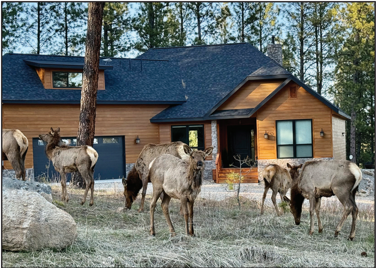
At the home of one of our local Garden Valley fire department volunteers, this volunteer fire patrol was also on duty this weekend, grazing in the neighborhood.

IDAHO CITY -- Boise Basin Senior Center will hold its annual Easter celebration on Thursday, April 17, starting at 10:45 AM. The event promises a delightful day filled with joy and community spirit. Easter Raffle Basket One of the highlights of the celebration will be the drawing for the Easter raffle basket. This basket is brimming with goodies, including $30 worth of gift cards, chocolates, candy, Easter socks, and an adorable bunny. Tickets for the raffle are available for $1 each or 6 for $5. You do not need to be present to win; simply stop by the Senior Center to get your tickets. Special Lunch Menu A special lunch menu featuring ham and scalloped potatoes will be served. Join us for a sumptuous meal and Easter fun, complete with door prizes. Upcoming Yard Sale Looking ahead, the Senior