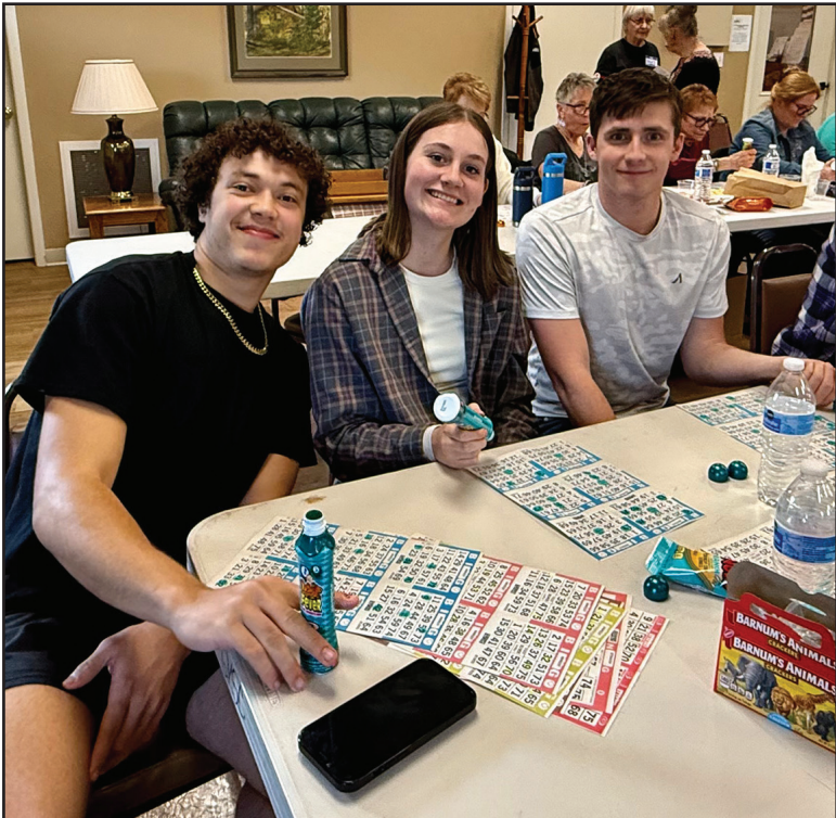
The younger generation has discover the fun of bingo.