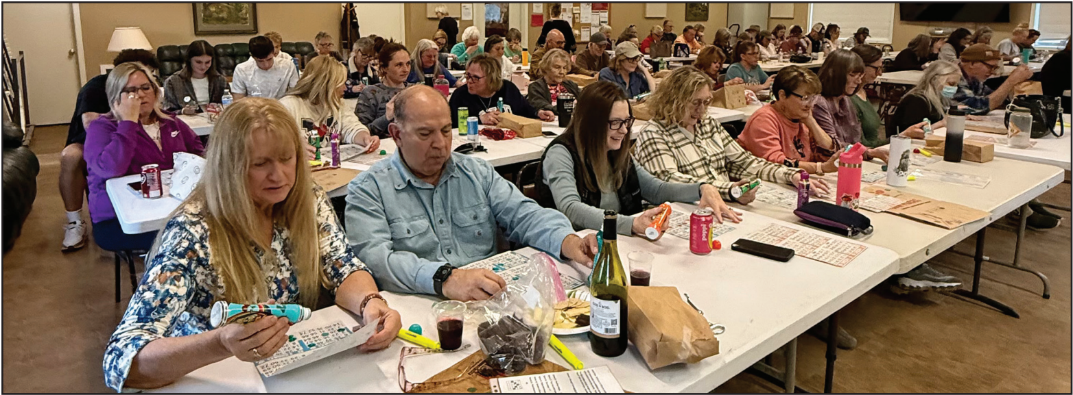
There was a full house at the senior center for bingo on April 7th.