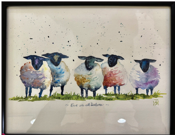
Sheep in watercolors