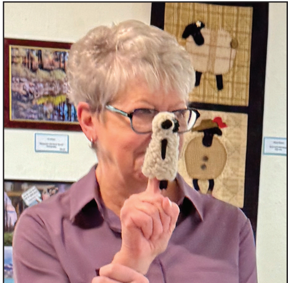
Felted finger puppet lamb