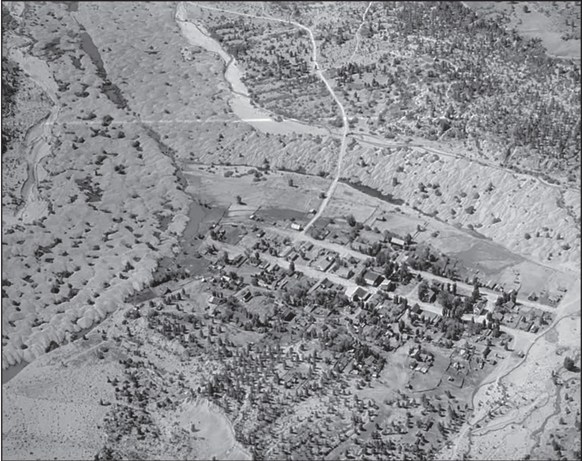
In 1925, the Army Air Corps conducted a series of aerial photographs that captured the evolving landscape of Idaho City.

The 1925 aerial photographs taken by the Army Air Corps are invaluable historical documents that capture the essence of Idaho City's transformation. They provide a detailed record of the city's infrastructure, natural features, and architectural heritage, offering a glimpse into the past that continues to resonate today.