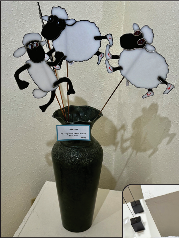
Stained glass garden stakes