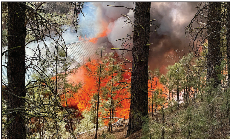
One hour later, the roof re-erupted with flames.

"An investigator from the Idaho State Fire Marshal's Office was unable to determine the exact cause of the fire due to the extensive damage and hazardous conditions. However, based on witness statements and photos provided, it is suspected that combustible material (structural) was too close to a heat source (chimney pipe)."