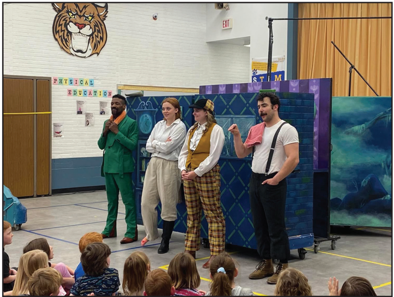
Idaho Theater for Youth

The success of this presentation underscores the value of partnerships between schools and community organizations in providing diverse opportunities for students.