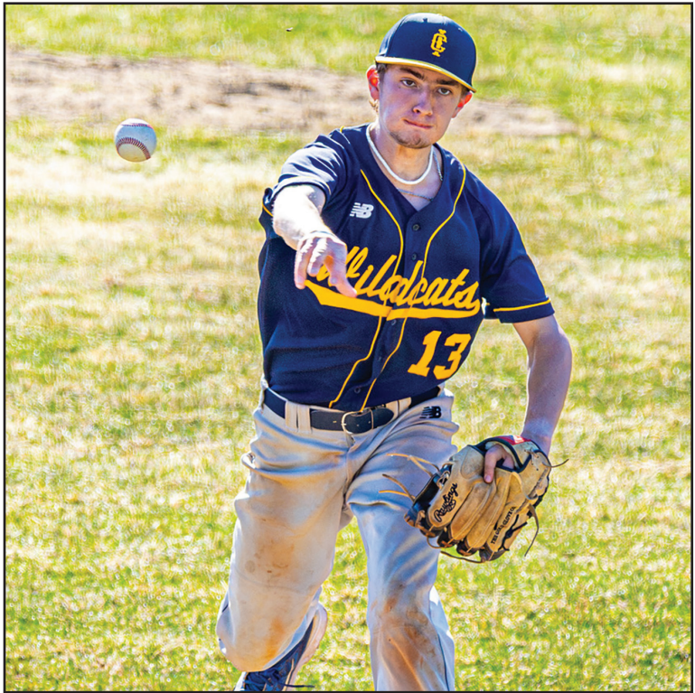
The Wildcats played the Garden Valley Wolverines on April 14th and won, 13-2.