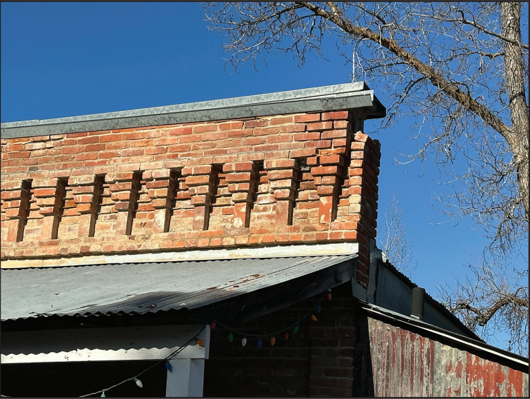
Bricks were falling from the top of the museum.