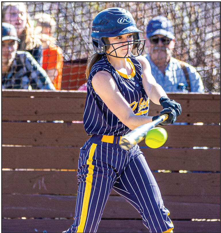
The girls took a big win over Notus, 33-2, on April 14th.