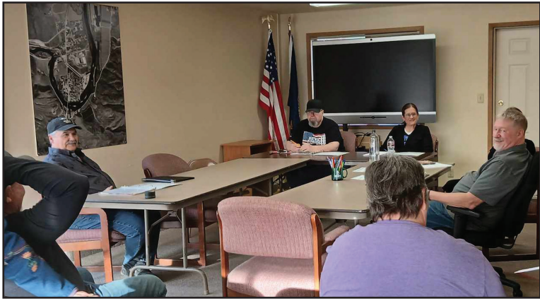
The Horseshoe Bend City Council prepares for their meeting on April 9.