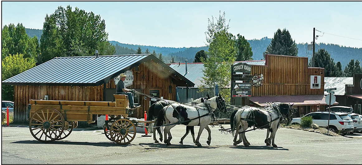
A nostalgic horse-drawn wagon clip-clops through Crouch in August of 2023.

And just like that, a village was born—one fueled by laughter, whiskey, and the roll of the dice.