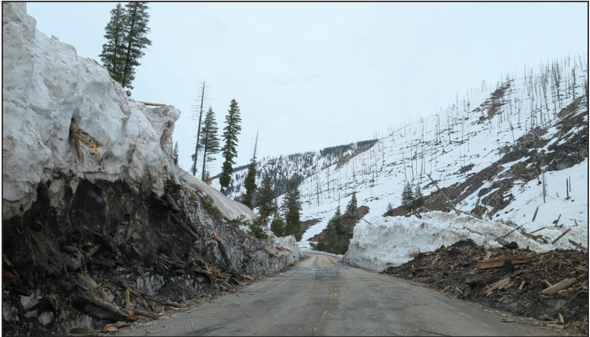
Highway 21 between Lowman and the summit on April 11th, evidence of avalanches.

•Inform someone: Let friends or family know your travel plans and estimated return time. •Stay on maintained roads: Avoid venturing onto non-maintained or closed roads, regardless of the season. As we embrace the beauty and joy of spring, let us be mindful of the lingering dangers from winter and take the necessary precautions to ensure safe and enjoyable experiences. Boise County Search and Rescue is here to assist, but prevention is the best strategy. Stay safe, stay prepared, and enjoy the season responsibly.