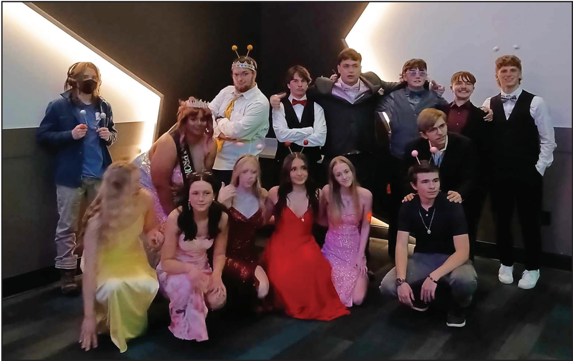
The entire Horseshoe Bend Class of 2025 posed together as they celebrated their final Prom at the Galaxy Event Center in Meridian on April 12.

again, this time at Adrian High School for the Adrian Invitational. Events are scheduled to begin at 11:00 a.m., where the team will look to continue their growth and build on their early-season successes.