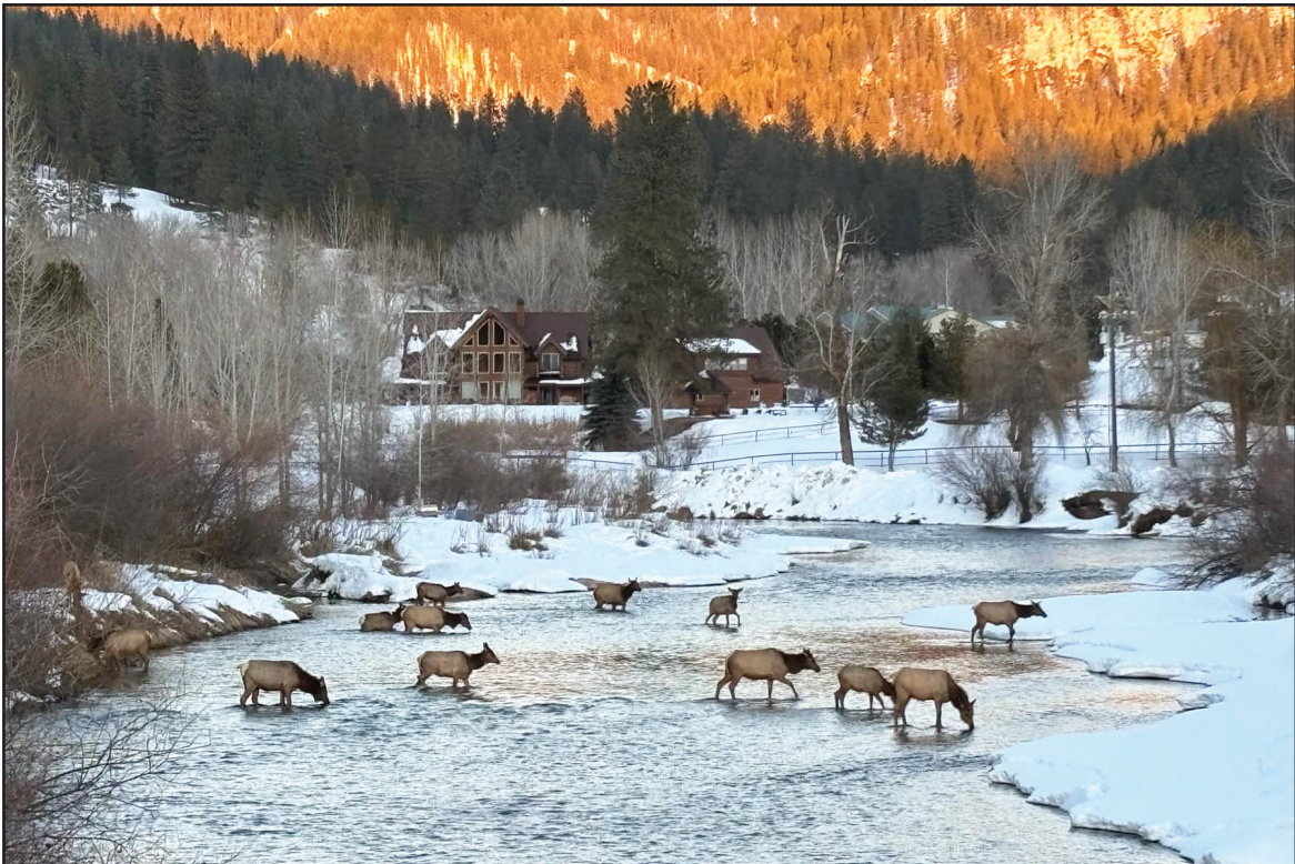
Elk crossing the river by Crouch.