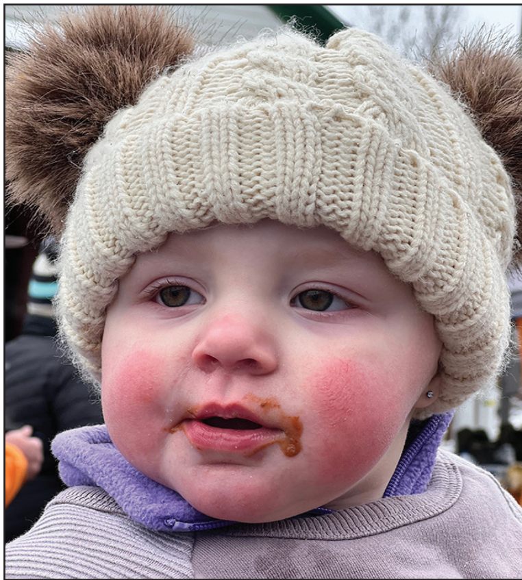
Last year's 1st time chili taster.

Chili goers can expect live music, new chili pepper guys sweatshirts, a mini shootout, and loads of hot chili! This is the Idaho City Chamber's biggest fundraiser of the year. Please come support our little mountain town and enjoy the spices of the season.