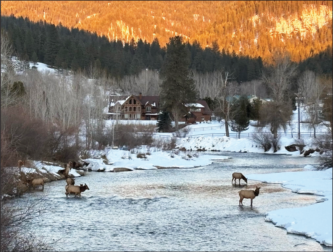
A beautiful day in Boise County, Idaho.