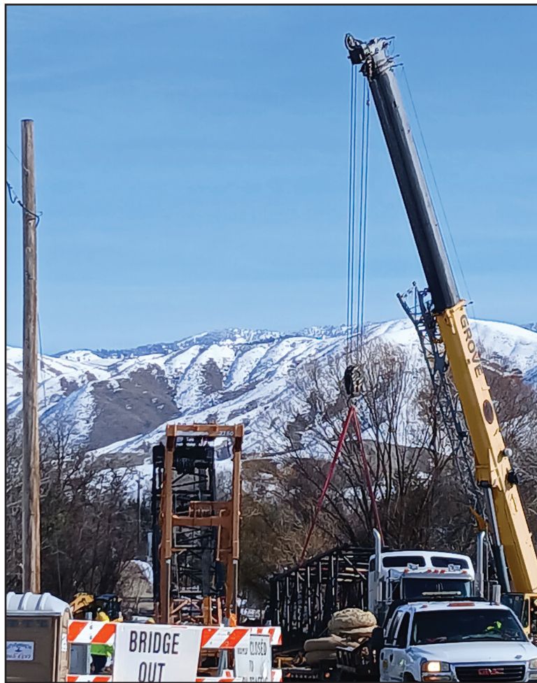
The bridge is undergoing disassembly.

The bridge is currently undergoing disassembly in preparation for the construction of a new, safer bridge to serve as the primary crossing point. Local residents and visitors alike are eager to see the legacy of the old bridge continue, with its pieces living on in two nearby parks as lasting symbols of the area's rich history.