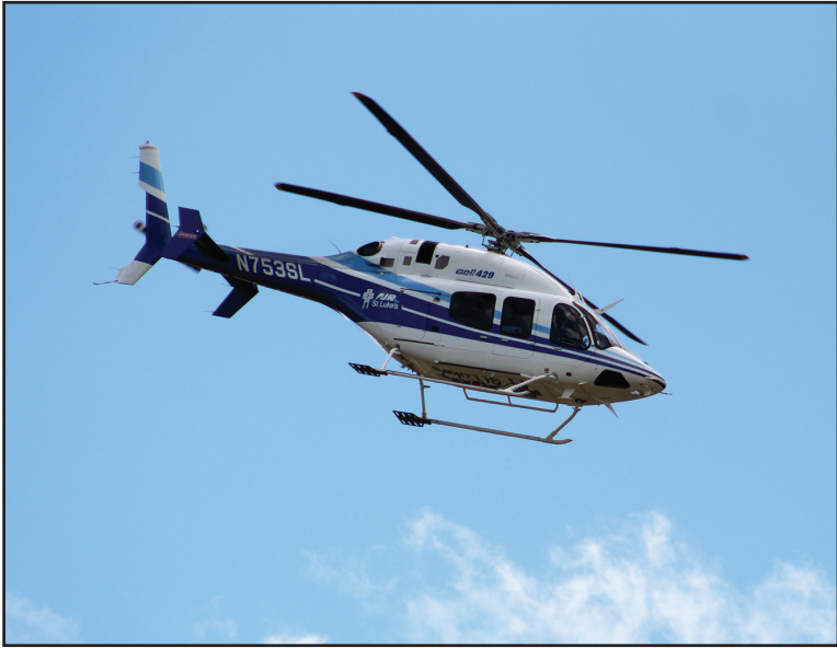
Air St. Luke's

I share this information so that people can make an informed decision. AirMed membership costs around $70 a year for yourself and family members. I figure that's cheap insurance. We all work hard for our money and why let an event in our life put a strain on our finances?