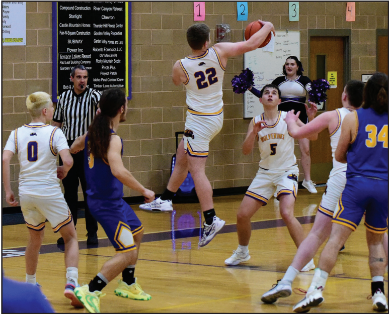
Marshall grabs the rebound