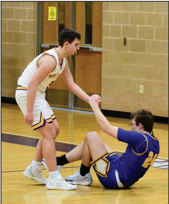
Show of sportsmanship

On 2-18-25, Garden Valley Boys' Varsity took their first step in Districts by winning against Salmon River (blue) 67-41.