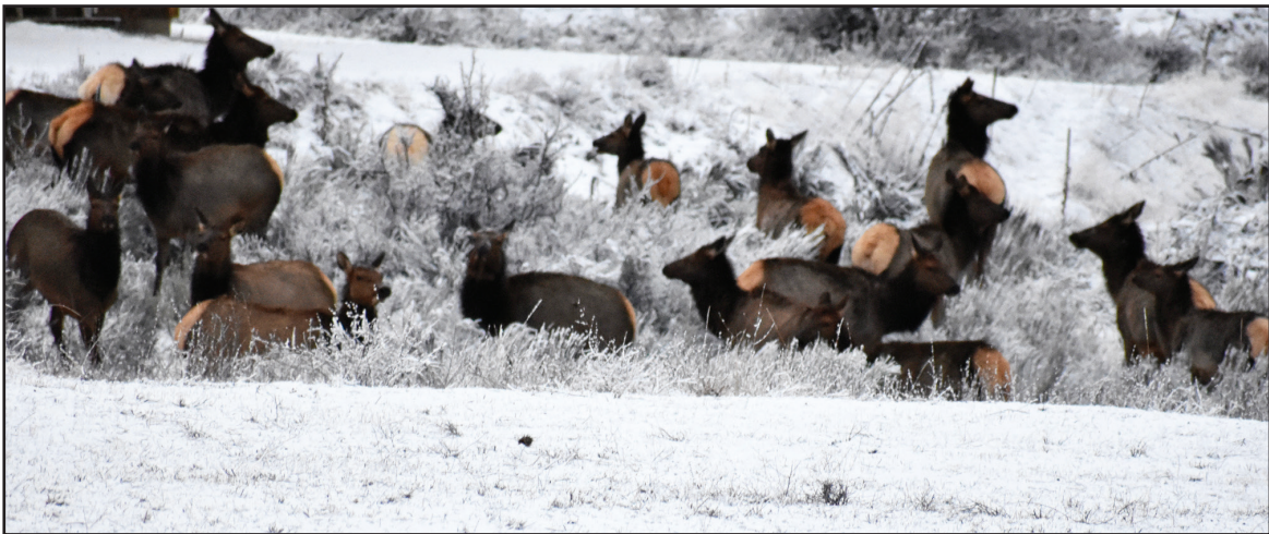
Elk in the snow.

IDFG Headquarters 600 S. Walnut Street Boise