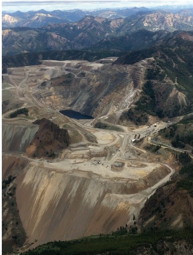
The Thompson Creek Mine is one of the largest molybdenum mines in the U.S. and is located in the Salmon-Challis National Forest. This open pit concept is being considered further down the line for this mineral deposit located north of Idaho City.

lant stewardship of all natural resources.” In the past, they have attended events in Boise County, offering handouts, possible future employment, and discussion. Idaho Copper Corporation (IDCU) environmental policy states that they are committed to: “Conducting all exploration and development activities, present and future, in a manner that ensures a minimal impact on the environment. Each and every decision made by the development team is focused on designing an environmentally sound and socially responsible project.” The American CuMo Mining Corporation acquired many of the privately owned mining claims in 2004 and has completed exploratory drilling on public and private lands since that time. In 2012, CuMoCo was allowed to drill 137 holes and construct 10.2 miles of temporary roads, adhering to the rules set by the U.S. Forest Service. North of Idaho City, there is an estimated 6 billion tons of molybdenum oxide, copper, silver, tungsten, and rhenium worth around $70 billion.