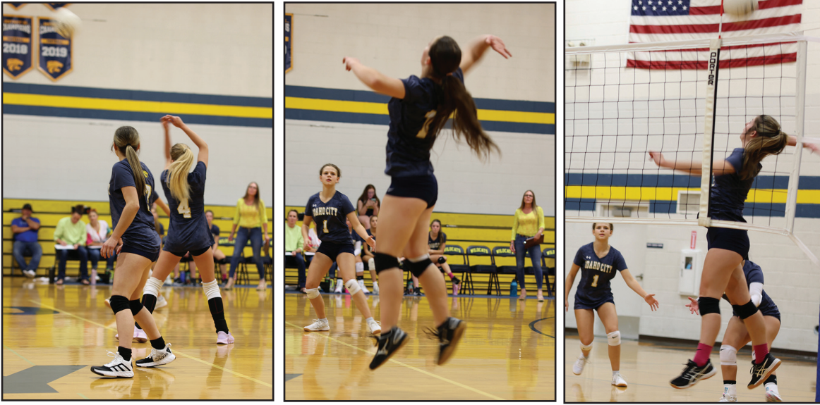
ICHS lost against Liberty Charter on Tuesday, Sept. 24, but played tough.