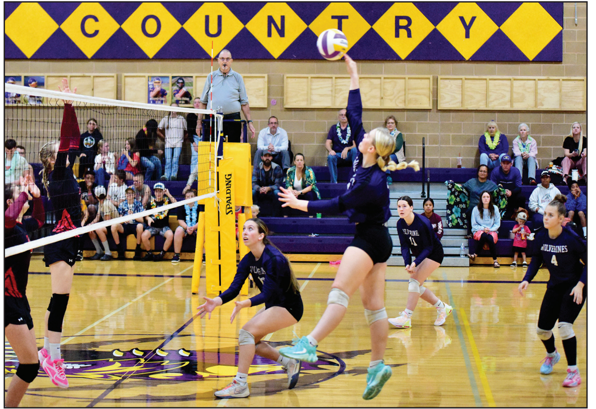
The Lady Wolverines have been tough to beat this year and won their past four matches! They are sitting at nine wins after they beat Tri-Valley on Sept. 18th. They play the #1 seat, Horseshoe Bend on October 4th.