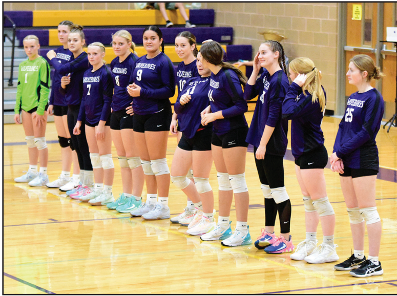
GV Varsity Volleyball Team on 9-16-24. GVHS Varsity rallied and fought hard to beat Council Varsity in five sets, 25-15, 15-25, 25-22, 23-25 and 15-13. Fans arrived clad in Hawaiian attire.