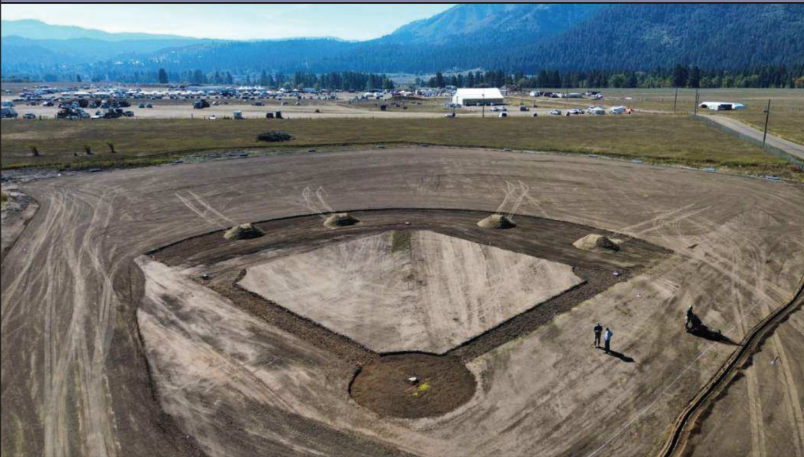
Aerial view of the baseball field development in Garden Valley.

GARDEN VALLEY -- Volunteerism and private funding have leveled the playing field, fueling the momentum to complete a high school baseball field for the Garden Valley community. Truly a labor of love, the dream of seeing our local high school seniors play ball in front of their families, on their own home field , has propelled much of the work to be completed in a relatively short period of time. Volunteers have been working between nine to twelve hours a day, pushing themselves to get the field ready for winter.