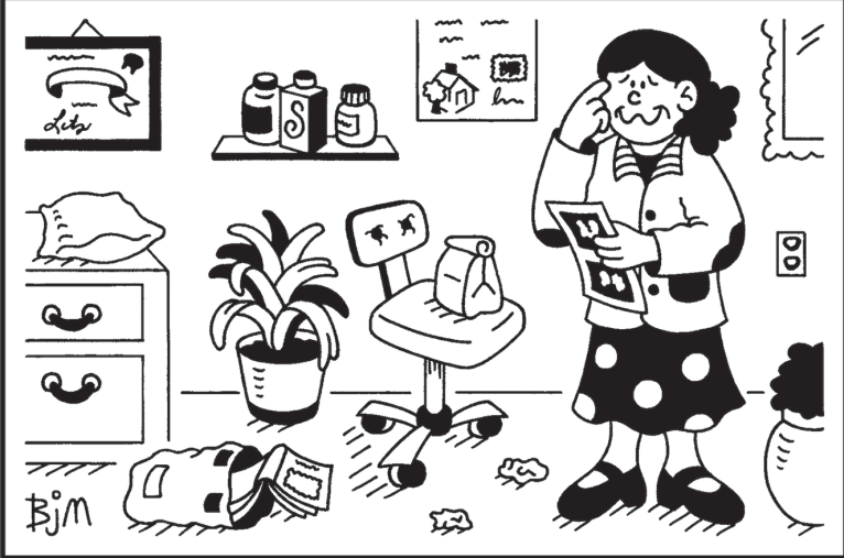
Answer key on page 6.