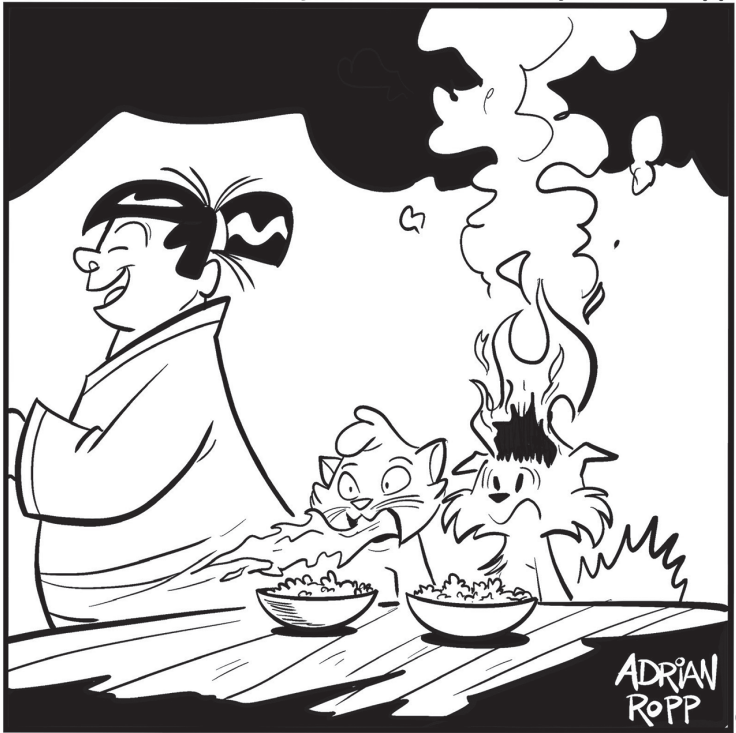
"WHAT DO YOU THINK OF MY COOKING?"