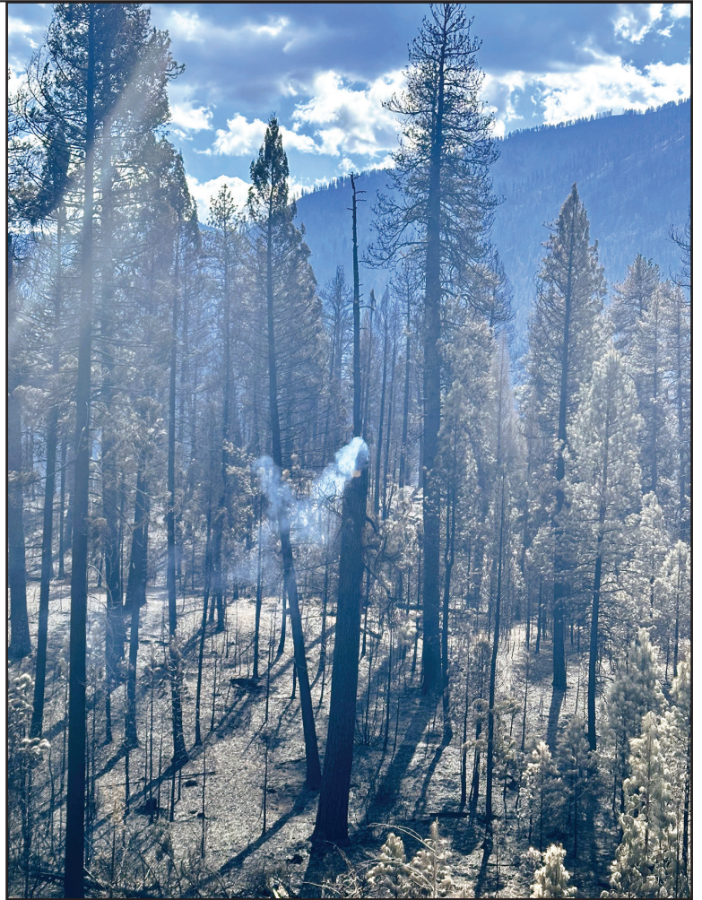
Fire still smoldering near Lowman.