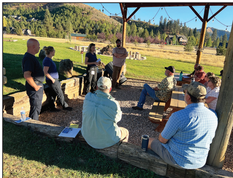
Members of East Boise County Ambulance District have been holding public meetings throughout the district to help the community understand the dire need that exists for rural emergency services. This meeting was held on Tuesday, Sept. 24, in Osprey subdivision.

I have had the honor of serving this community in times of need. Whether it is the calm reassurance to an anxious parent or the urgent response to a critical situation, being there with the ambulance has been more than just a job—it is a calling. Every time those sirens wail, it is a reminder of the trust the community places in us and