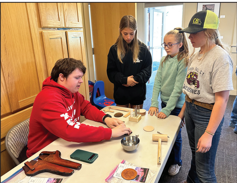
By Linda Ruppel, DDS GARDEN VALLEY --