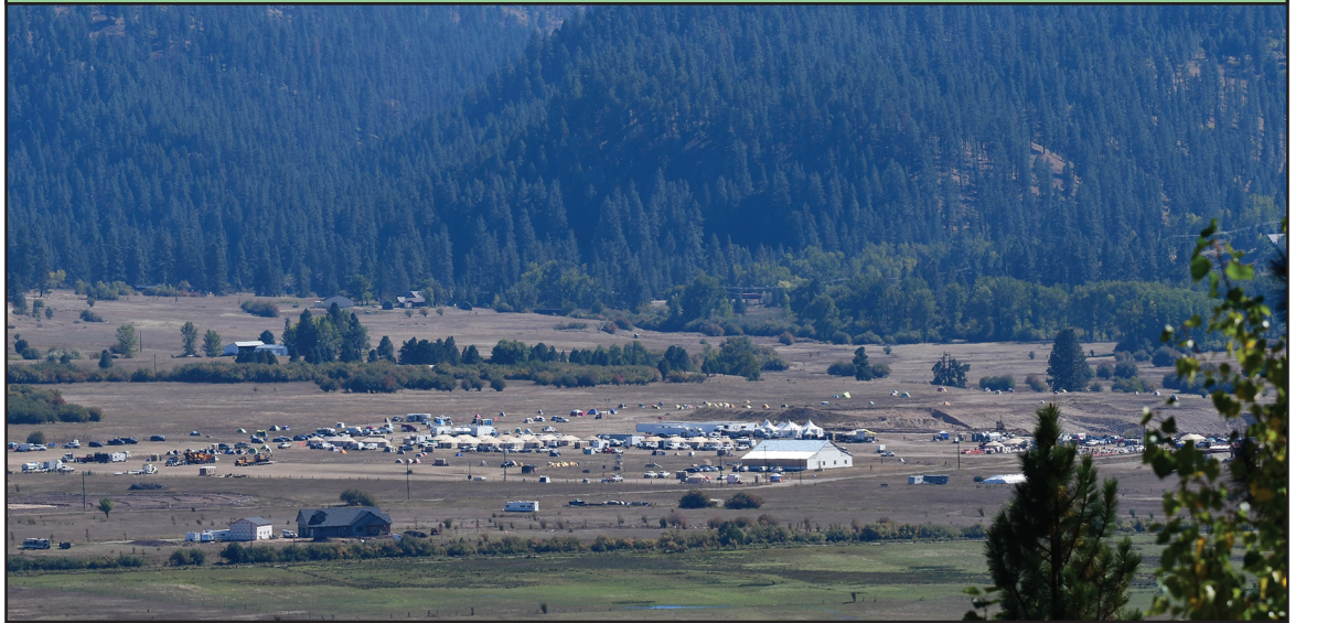
Middlefork Fire Camp on a beautiful clear Sunday, September 22.

GARDEN VALLEY -- What a difference a few days make! The cleansing rain cleared up the valley of smoke and provided the opportunity to photograph the view of the Middlefork Fire Camp Complex. It is amazing to see this "mini" contained city which supplies, houses, feeds and takes care of hundreds of firefighters and several spike camps. They have been a blessing to us all this summer. The complex burned 61,484 acres [Sept. 22nd], has 553 personnel, and is 85% completed.