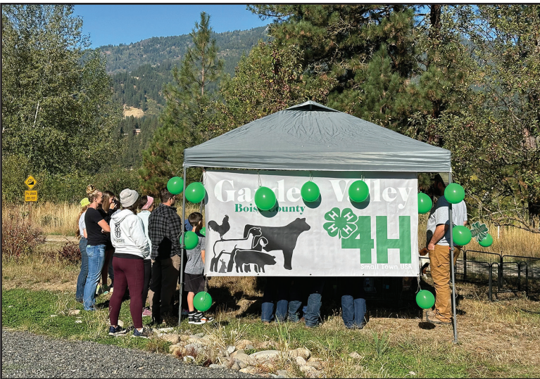
The Garden Valley District Library hosted 4-H on Saturday.