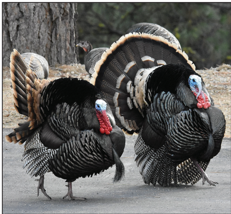
Boise County turkey strut.

HORSESHOE BEND -- After being named a Blue Ribbon School in 2017, Horseshoe Bend Elementary has just been named on the US News and World Reports 2024 Best Elementary School rankings. The rankings are derived from calculating data within each state from 45,236 elementary schools nationwide. The rankings assess student achievement in mathematics and reading within their states. The rankings are purely based on academics and are gained from publicly available data that is required to be reported to the U.S. Department of Education. Pictured: 2018 Blue Ribbon Flag raising ceremony at Horseshoe Bend Elementary School.