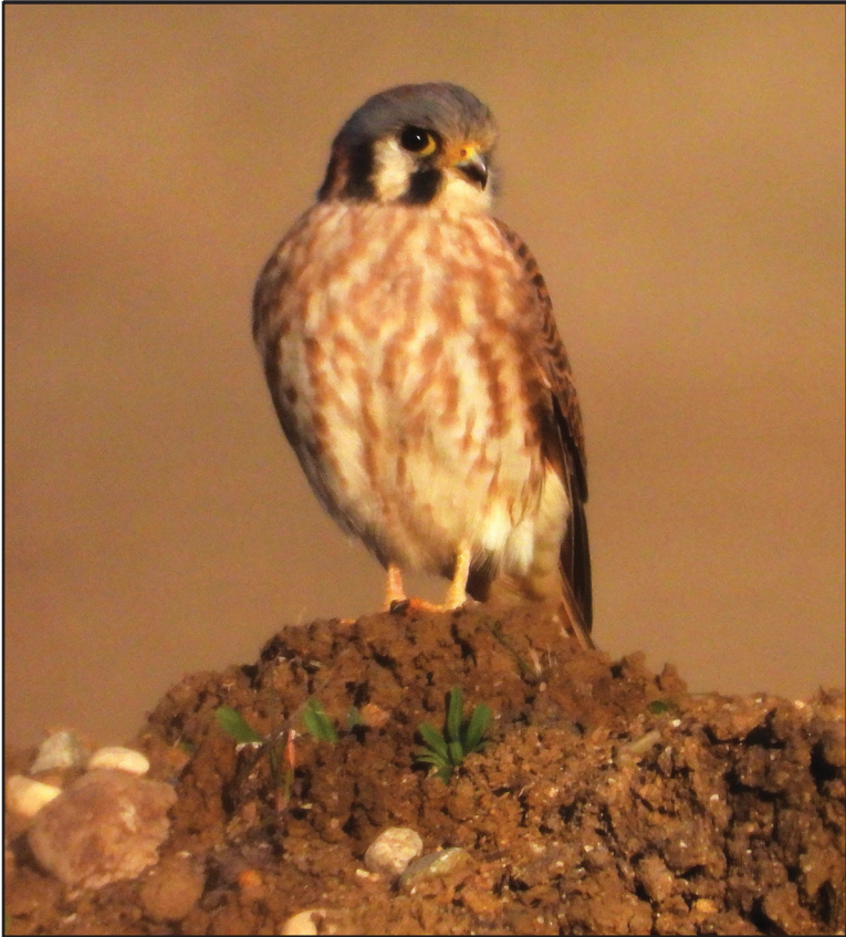
American Kestrel, female, in HSB

Published in the Idaho World on 11/22, 11/29 and 12/6/2023.