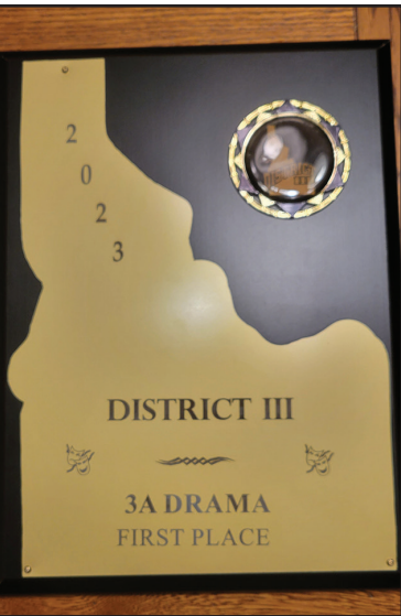
Champion plaque presented to the GV Drama Team.

86% of the team is moving on to State in Pocatello on December 1st and 2nd. State is December 1st and 2nd at Century High School in Pocatello.