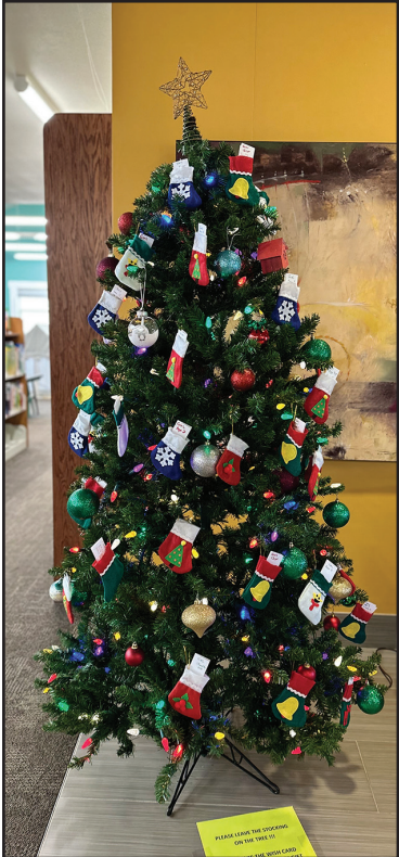
Garden Valley Library hosts this year's annual Christmas Wish Tree.