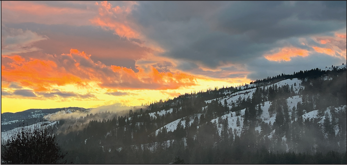
A snowy sunset among the pines, January 2023.