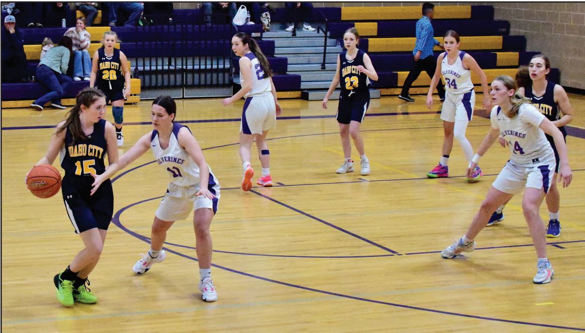
On 11-15-23, Garden Valley High School Varsity Girls Basketball (white) took on the Idaho City Wildcats (black), and won 56-21.

The Wolverine JV team played the Idaho City Wildcats on 11-15-23. The GV team was in purple and the IC in white. It was a tough game, but the Idaho City team emerged as the winner.