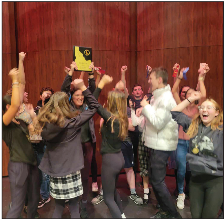
Wolverine Drama Team wins big at competition on Saturday, November 18th.