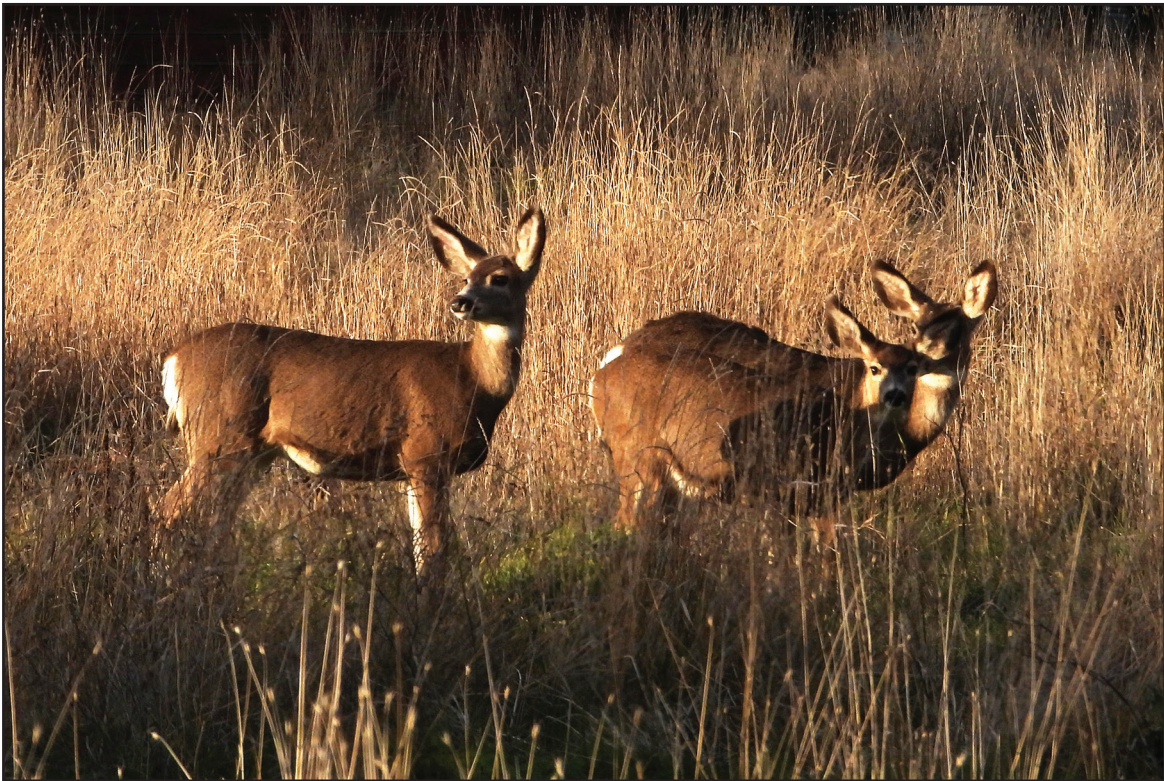
Mule deer just before sunset, Horseshoe Bend