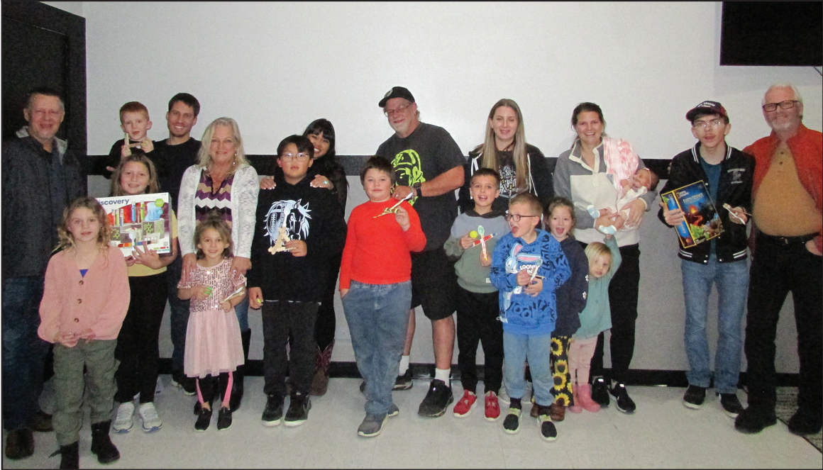
Horseshoe Bend families engineer catapults during the district's first Family and Community Engagement Night on November 16.