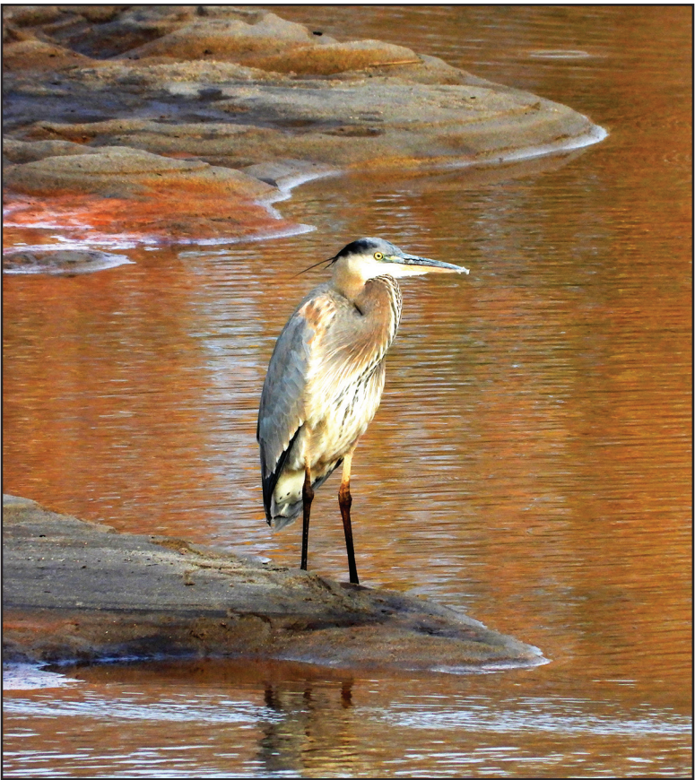
Great Blue Heron, Black Canyon Reservoir between Horseshoe Bend and Emmett

throughout the world and their creators. At the conclusion of the movie, families were given brief instructions and all the material they needed to construct working catapults. Prizes were given out to the teams whose catapults were the most accurate, had the best distance, were the most artistically decorated, and to the catapult that was the most uniquely designed.