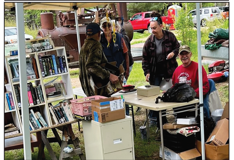
The Idaho City Historical Foundation held its annual Yard Sale of Historic Proportions last weekend and there were lots of treasures to be found.