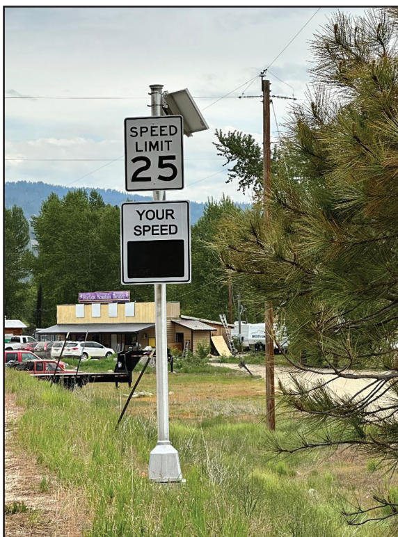
Solar powered digital speed advisory signs have been placed on both sides of the Crouch city limits on the Middlefork Rd.

The city was able to fund this project mainly through the use of monies derived from the Local Option Tax (LOT) which voters passed last year.