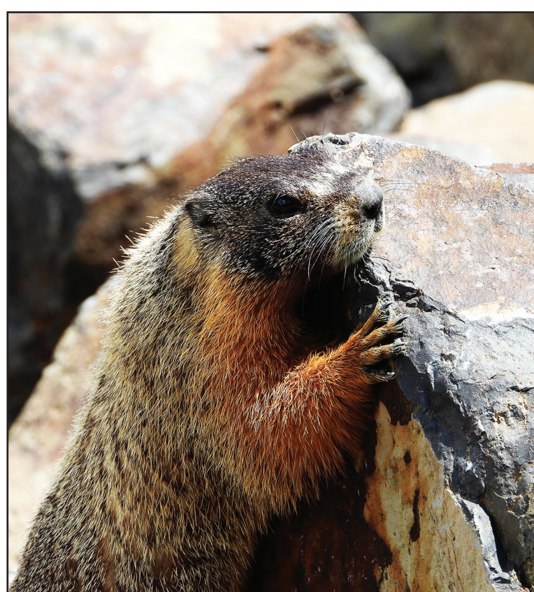
This yellow-bellied marmot (this is the official name, some people call these animals rockchucks, whistle pigs, etc.) was playing hide and seek with my family. Apparently, it did not know I was there, so I could see the hide and seek game.

Visit idahopower.com/wildfire for more tips on wildfire safety, such as how to build a summer outage kit, and to learn what Idaho Power is doing to protect the grid.