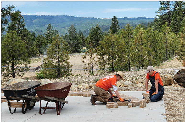
Legacy Park is a great destination to camp with your horse, offering enclosures and easy access to long trail rides through the National Forest. They are also able to host weddings and equestrian events.

Several volunteers from Team Depot, The Home Depot's associate volunteer force, and others gathered on May 25th to help with the construction.