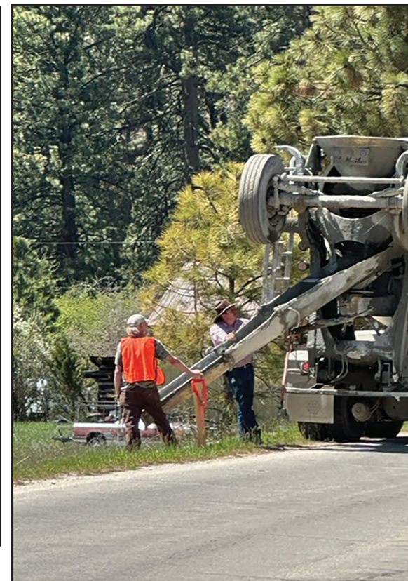
Pouring the cement to place the new sign.