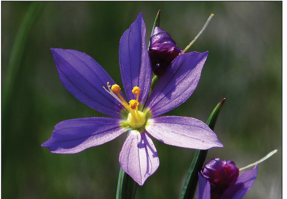
Idahoan Blue-Eyed Grass