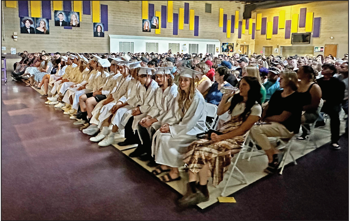
Graduation ceremony on Saturday at Garden Valley High School.