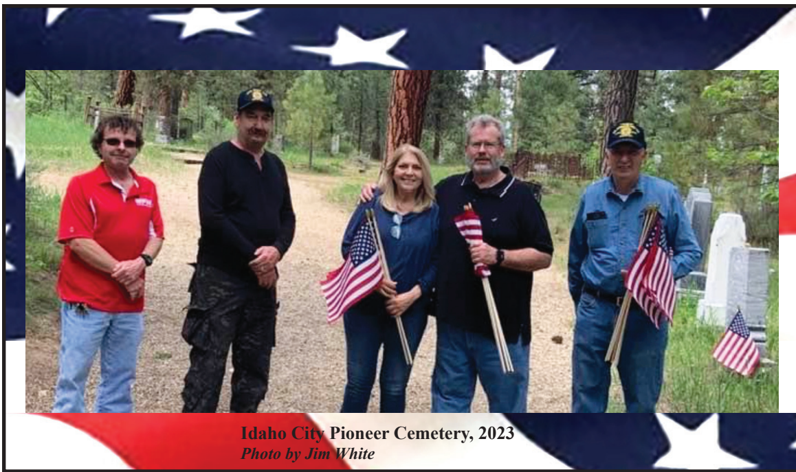
Idaho City Pioneer Cemetery, 2023