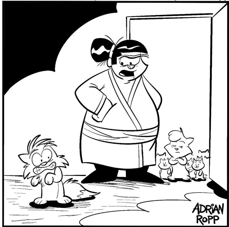
"I BELIEVE IT'S FOR YOU."