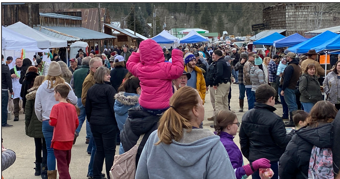
Come join in the fun at this year's Idaho City Chili Cook-off on March 5th!

Reading Room on the project webpage and will be released in their entirety, if requested, pursuant to the Freedom of Information Act.