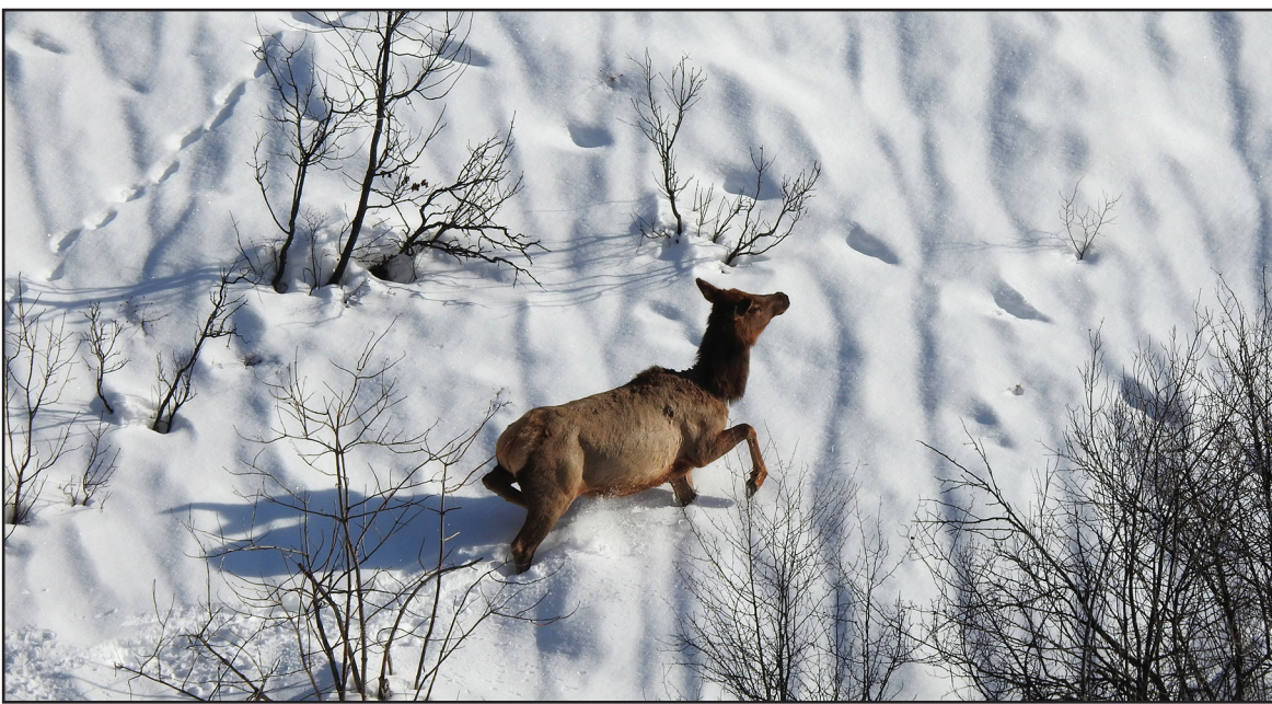
Unnoticed from the hill above, an elk walks by in Garden Valley.