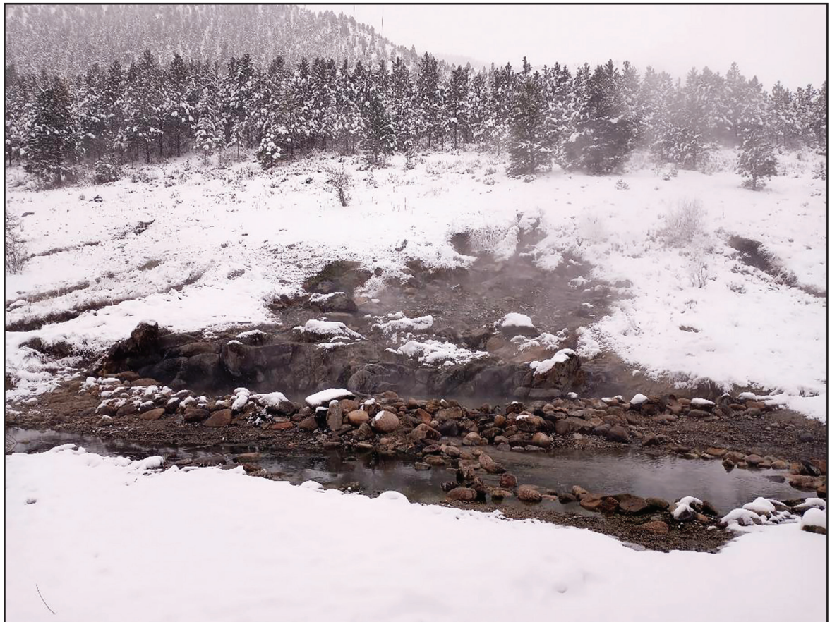
Kirkham Hot Springs pool