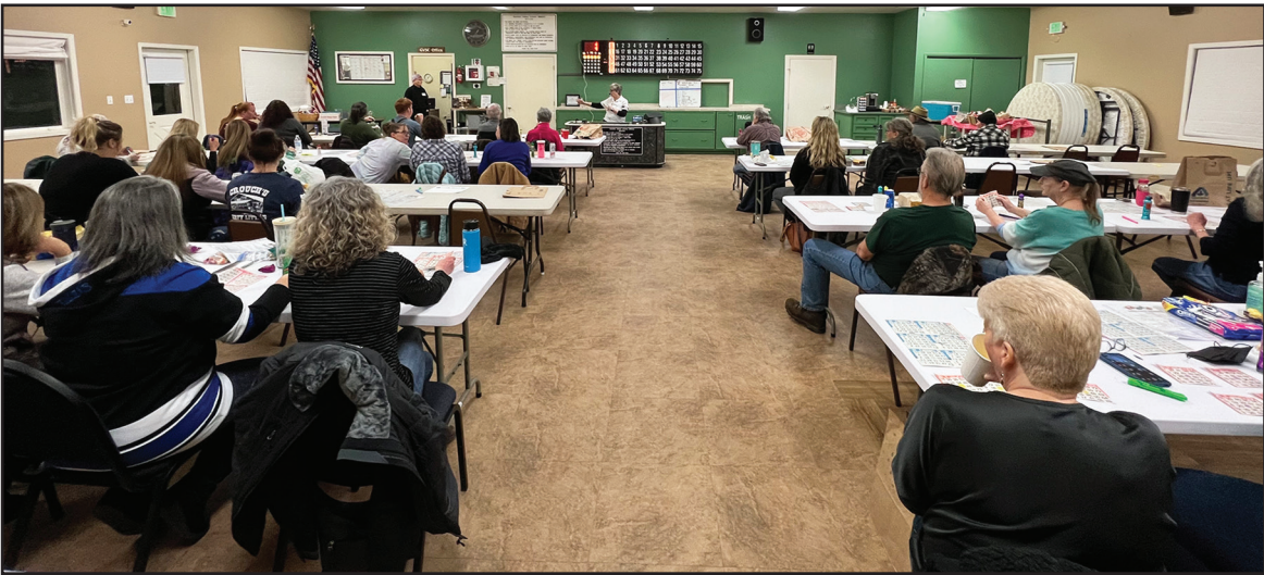
Bingo held at the Garden Valley Senior Center the first Friday of each month at 7 pm.