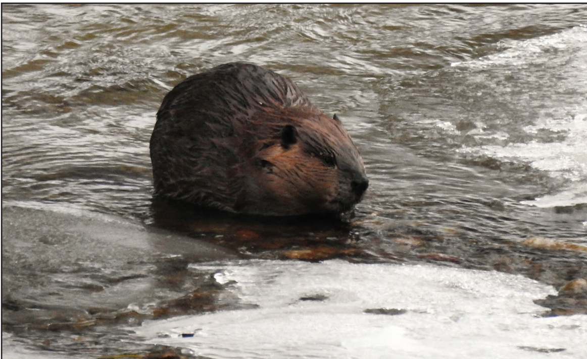
Beaver in Garden Valley.