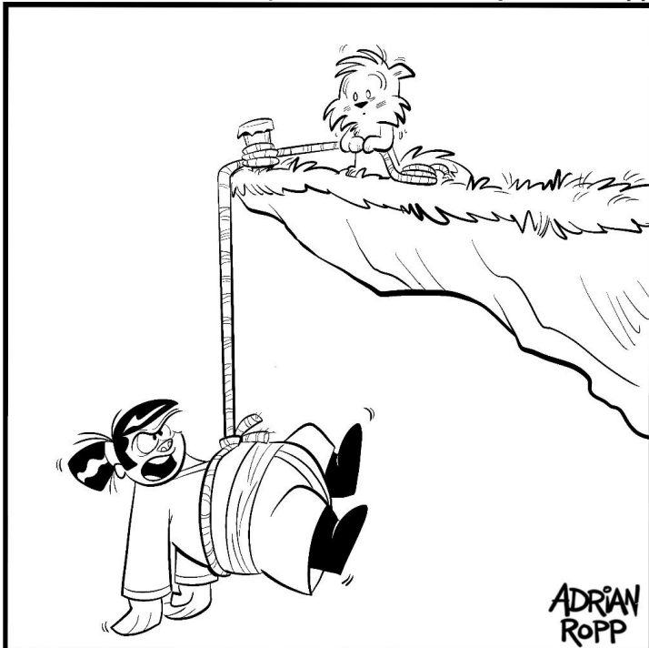
"I NEED A STRONGER SIDEKICK."