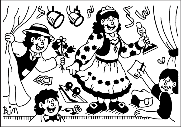
Solution at the bottom of page 7