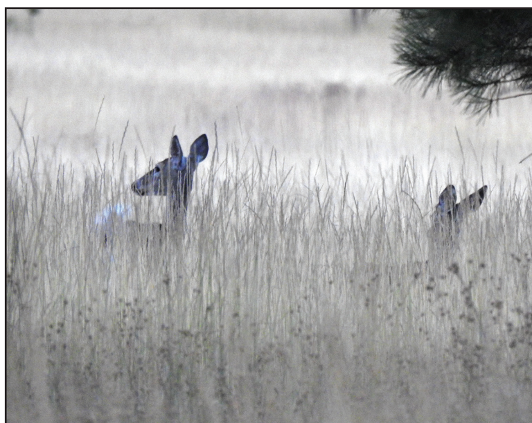
As evening settled in, a mother whitetail deer remained alert with her two grown fawns in tow, venturing through a field in Garden Valley.

Get A Better Deal On A Subscription Your Name Would Be Here & Delivered To Your Address Every Week Go to idahoworld.com to subscribe