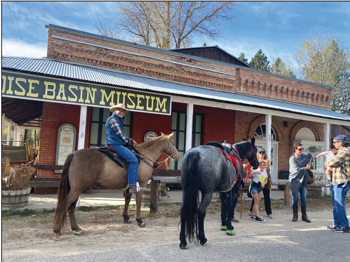
Hitching up at the ol' Boise Basin Museum in Idaho City this past weekend.