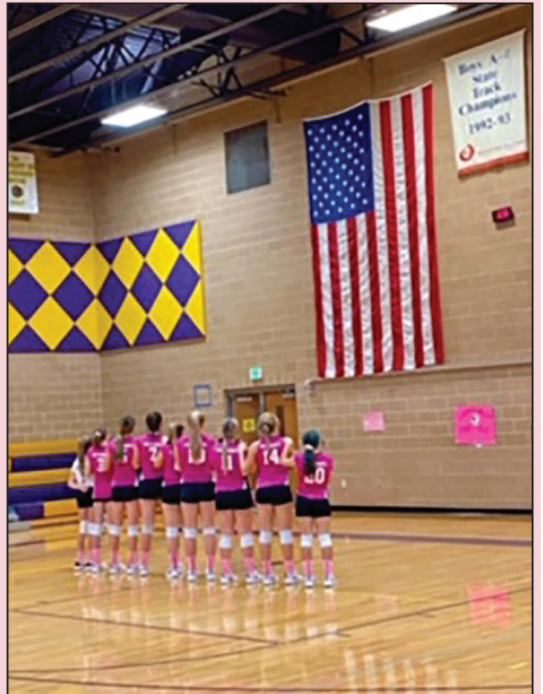
Standing together as a team dressed in pink, with respect to Breast Cancer Awareness during the month of October.