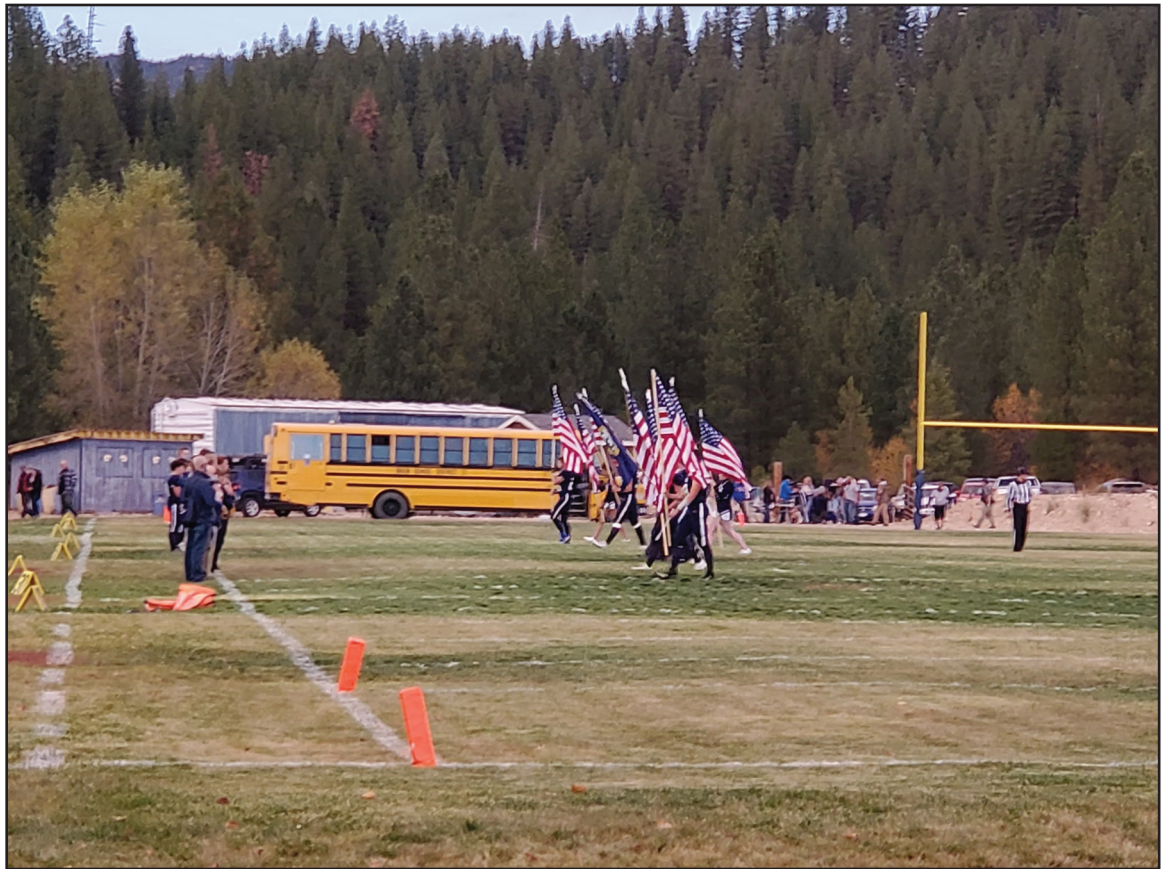
A special presentation took place on Friday night prior to the football game in Idaho City. VFW Post 142 members passed off American flags to each of the senior football players and cheerleaders during the National Anthem. This act of patriotism was inspired by a YouTube video.