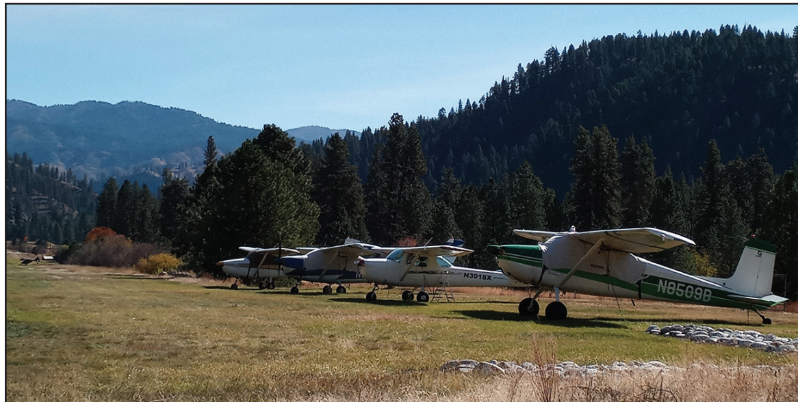
The Garden Valley Airstrip is a popular fly-in picnic and camping spot run by the Idaho Division of Aeronautics.