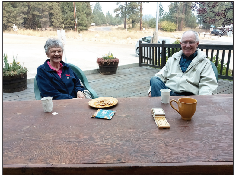
The Garden Valley Senior Center wants to provide a safe, fun place for our members and their friends to informally socialize every 1st and 3rd Monday-Wednesday from 9 a.m. - Noon. We have named this senior social time at the Center: COOKIES AND CHATTER . Cookies, coffee and tea are available. It's really nice to sit (with a jacket) on the deck/patio on crisp Fall mornings.

nice potluck lunches and enjoy the company of others. Every FRIDAY (5-7 p.m.), our fun F.A.S.T. Crowd meets up to laugh, play games, and share refreshments. Additionally, every other week, stop by the Center between 9:30 and 11:30 a.m. on Mondays and Thursdays to just hang out with us or meet up with your friends/family and have some cookies with a hot cup of coffee or tea. We call this "Cookies and Chatter" time. Check our Calendar on the website for the cookie days. As always, the most current GVSC news can be found on our website: gvseniorcenter.org -So check it out! And stop by the Center at 261 South Middle Fork Road in Garden Valley. Hope to see you SOON!