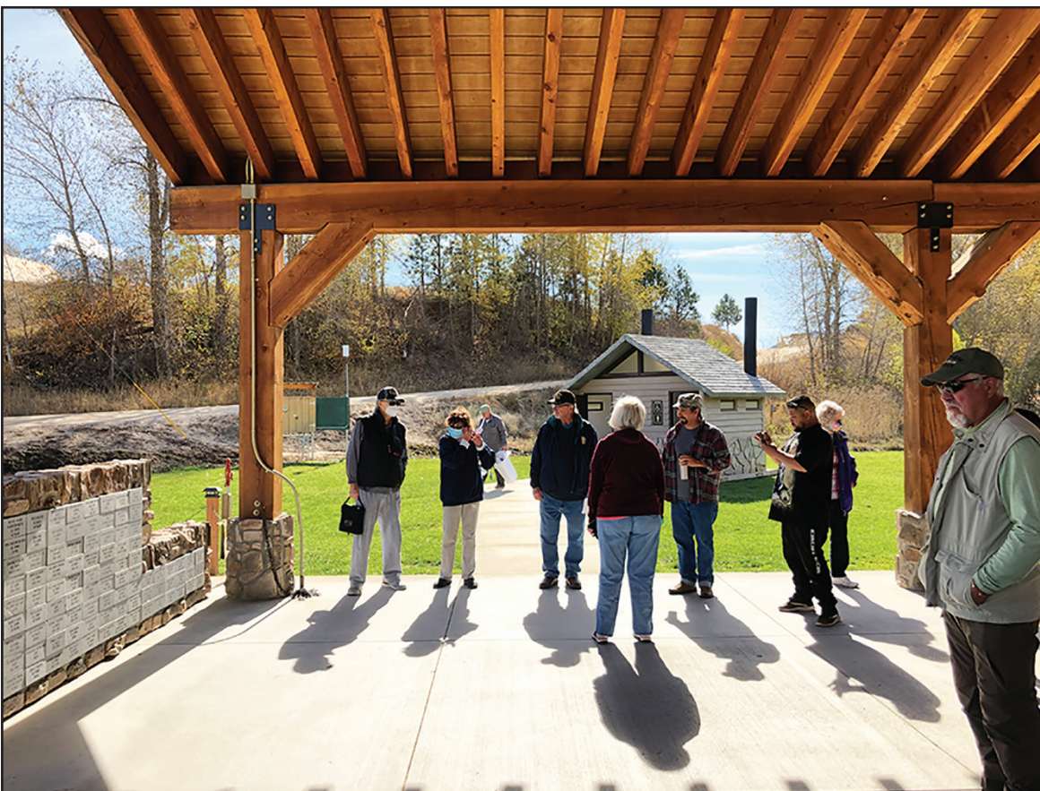
A small gathering of those who purchased the remaining twenty-four bricks, who were invited to the most recent installment in the growing wall of veterans. Those invited spoke about their family members, friends, and their service in the U.S. military.