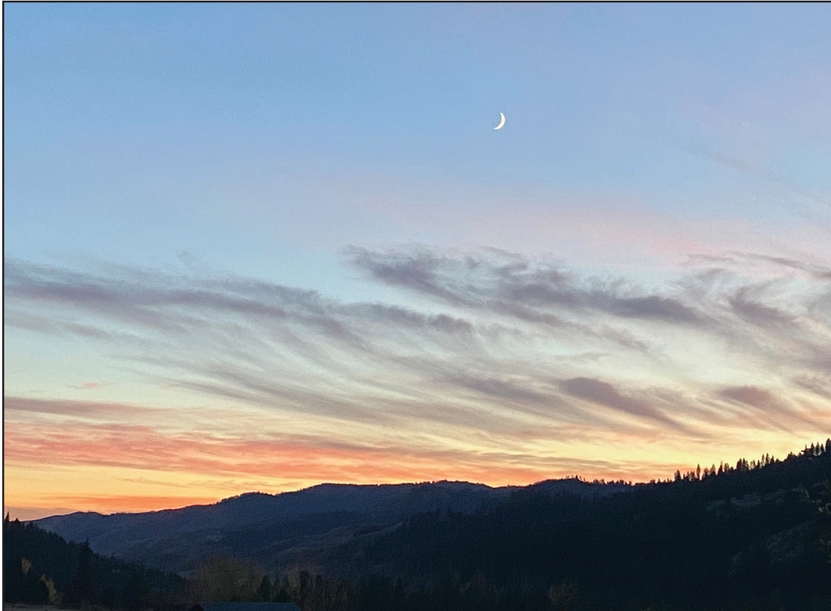
Monday night's sunset, sweeping clouds, and crescent moon.