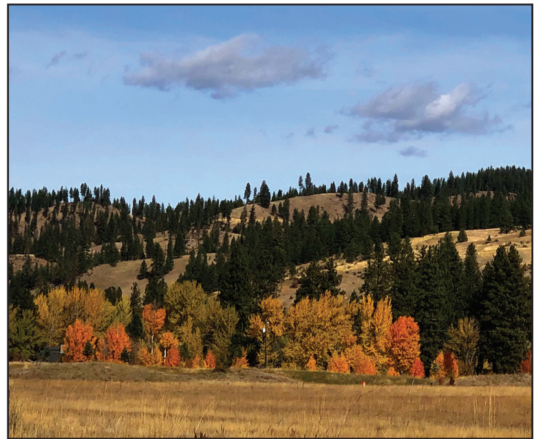
Fall colors in Garden Valley