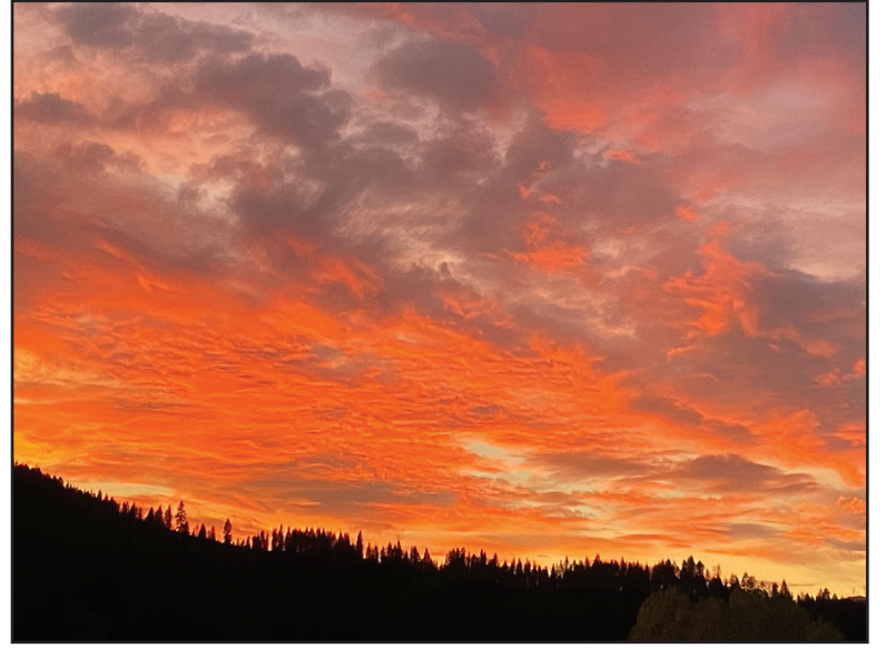
Fiery red sunset on Friday, October 16th, in Boise County.