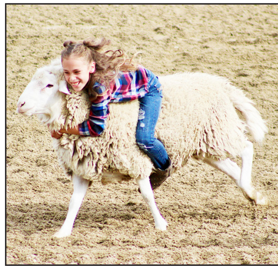
A score of 65 won the buckle on Saturday