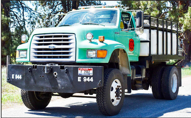
HSB Volunteer Fire Dept. in 2018

The City of Horseshoe Bend has a day full of activities planned for the 4th of July. Starting at 8:00 a.m. and continuing until 10:00 a.m. there will be a donations-only breakfast put on by the city at Horseshoe Bend City Park. The donations collected from this breakfast go to help fund the following year's display. The annual parade will begin at 11:00 a.m. and businesses, organizations/groups, and residents are encouraged to be part of the parade (for more information contact the city at (208) 793-2219). Participants need to be at the staging area on