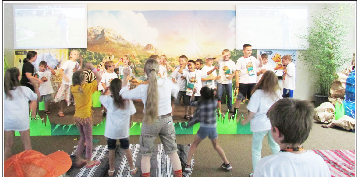
Students at Valley Christian Church's Vacation Bible School (VBS) enjoy a choreographic dance to "I'm Trusting You" by Lifetime Kids, part of VBS's ROAR series. The series took the kids on an African adventure narrative exploring God's goodness. Valley Christian hosted the event during the week of June 24 and over 35 local students were in attendance.