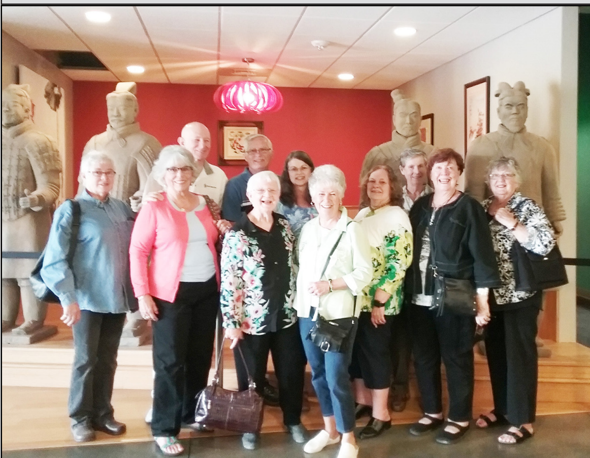
Payette Forward volunteers toured the Scentsy facility.