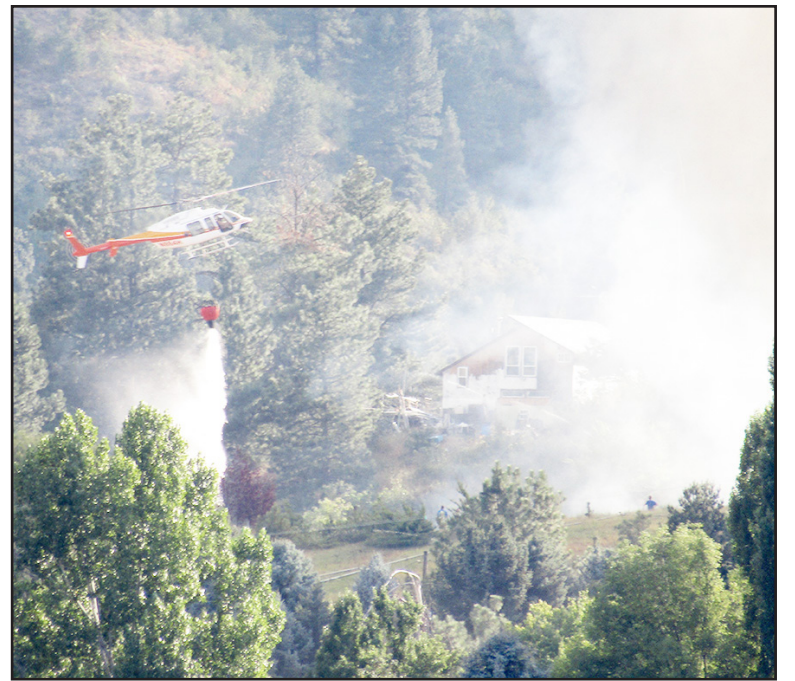
Fire burns near homes in 2017.