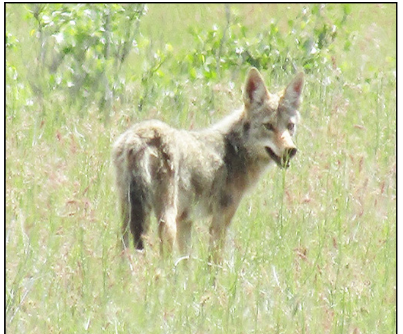
A coyote looks back with a smile.

Published in the Idaho World on July 3, 2019.