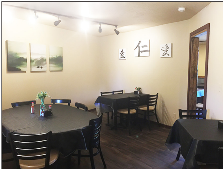
Choose your cuisine -- The Asian Room

The menu at the Fusion features your traditional Mexican fare, such as Enchiladas and Street Tacos. And they serve traditional Asian: Hand-rolled