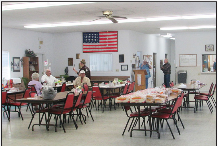
HSB Senior Center (above) main dining room.

Tuesday 8/29 -Biscuits and sausage gravy, scrambled eggs, hash browns, and mangoes