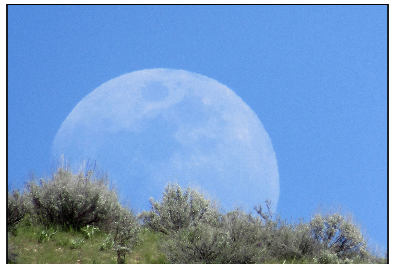
Moon rising over Boise County.

Visit tax.idaho.gov/eclipse for more information and to download an eclipse flyer, or call the Tax Commission at (208) 334-7660 in the Boise area or toll-free at (800) 972-7660.