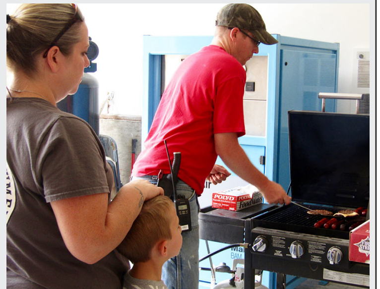
Serving up hotdogs & hamburgers on August 12th, which included: Live music, an auction, and raffle.