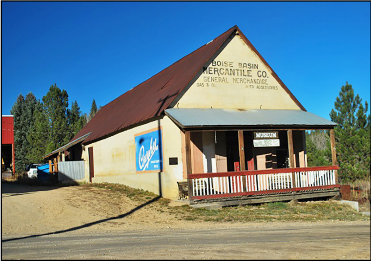
Boise Basin Mercantile Co. in Placerville, Idaho.

Since wild game became a scarce commodity by spring, what was needed was livestock. That meant chickens (eggs), cattle, hogs, and sheep, also needed for meat and for wool. Herds of cattle were brought in from California in 1863 and 1864 via up through southern Oregon past Goose Lake and across to the Malheur River, then on to Farewell Bend. The route was up from the Sacramento valley and on past Goose Lake on what is now the Oregon border and then across the wet areas north of Malheur and Harney lakes, then eastward across the Blue Mountains to the Malheur River and down to the Snake River, going on to the Boise and Payette valleys. But not all these trips were successful. At least two attempts to bring cattle over this route were cut short. One was in June 1864. An entire herd of cattle and sheep disappeared along this route. In August, 1864, cattle and sheep herders were attacked by Indians on the Goose Lake route. Some two herders were killed and 150 head of cattle were stolen. Native Americans within the Great Basin were always short on food which meant raiding cattle drives, which were common. Just as with pack trains, fewer men driving livestock were easier targets for Native Americans to attack. Sometimes the Native Americans would just scatter the cattle and leave the herd handlers to recover some of their herds but