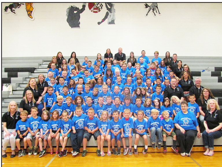
Students and staff of Blue Ribbon School nominee's Horseshoe Bend Elementary School.