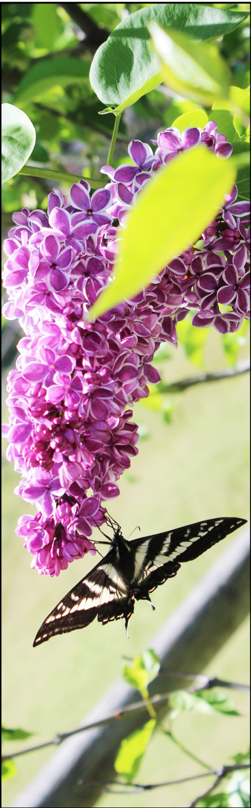
Lilacs in bloom attract a swallowtail butterfly.

Published in the Idaho World on 6/7, 6/14 and 6/21/2017.