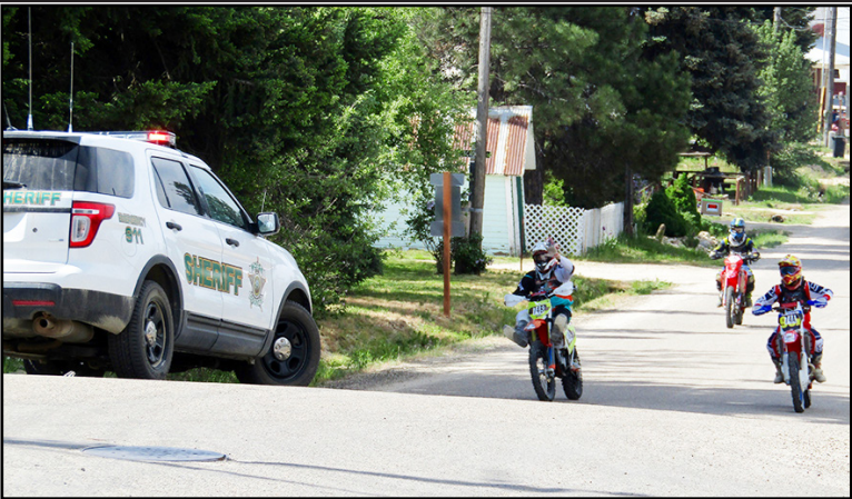
Motorcyclist head out to the 100-mile trail, from Main Street and up Bear Run Road.

In preparation for this enduro event, the Boise Ridge Riders obtain US Forest Service – Boise National Forest and