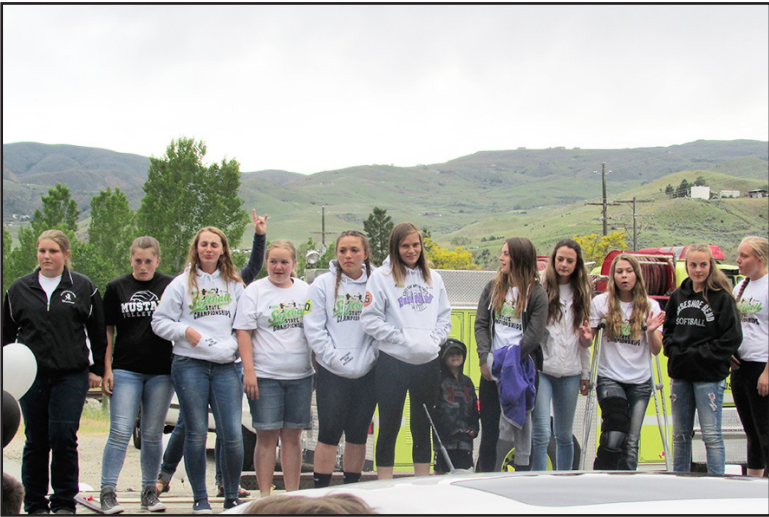
The community of Horseshoe Bend turned out in full force to celebrate HSB High School Varsity Softball team's State Championship at a parade, BBQ and bonfire held on May 25 in their honor. The team was undefeated throughout the tournament.