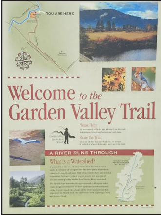
Visitors can look at a sign at the trailhead and see what things to look for, including the Mountain Bluebird boxes added to the trail last year.

Idaho Parks and Rec to help with the costs. This will need to include letters from local agencies and businesses showing approval and interest in a paved trail for the community. There are still many plans for the park to discuss including weed control, staining the pavilion, picnic shelters, a volleyball court and a playground. The position of Secretary on the Board is open as well. The public is welcomed to the meetings. The next meeting is June 28 at 6:00 in the Library activity room.