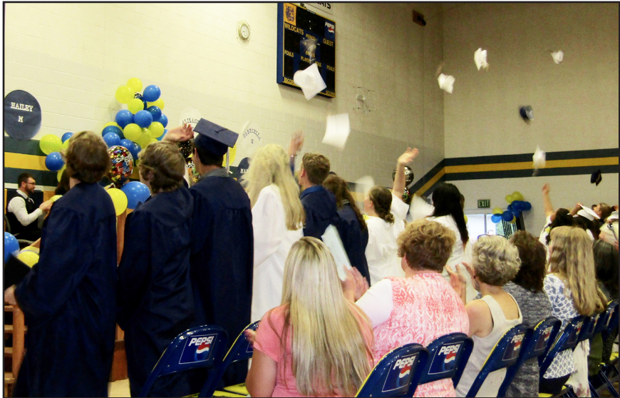
Twenty-two graduates threw their hats into the air!