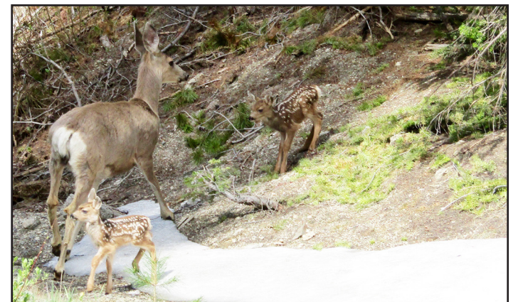
Twin fawns with their mother.

If you find a baby bird, duckling, squirrel or other critter, the best approach is to leave it undisturbed. Only move the animal if it is in harm's way, like found wandering in the road for example. Placing baby birds in a shrub or on a tree branch will help them avoid house cats. Don't fret about