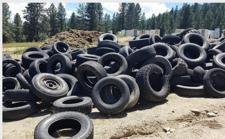
Tires stacking up at waste site in Garden Valley.