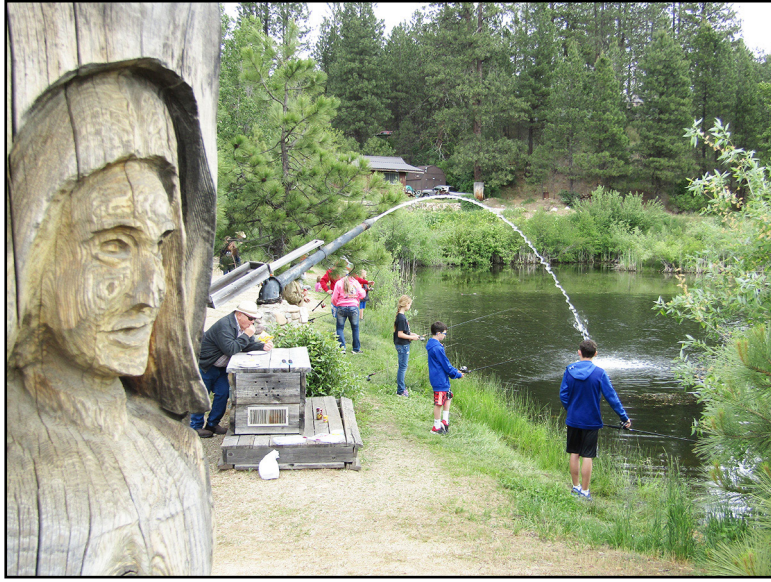
The Idaho City Visitors Center pond was a hot spot for fishing on Saturday.

A huge thanks to the Idaho City Chamber of Commerce and all those who participated, including donations of the facilities, time, support, food and the prizes that made this event a success!