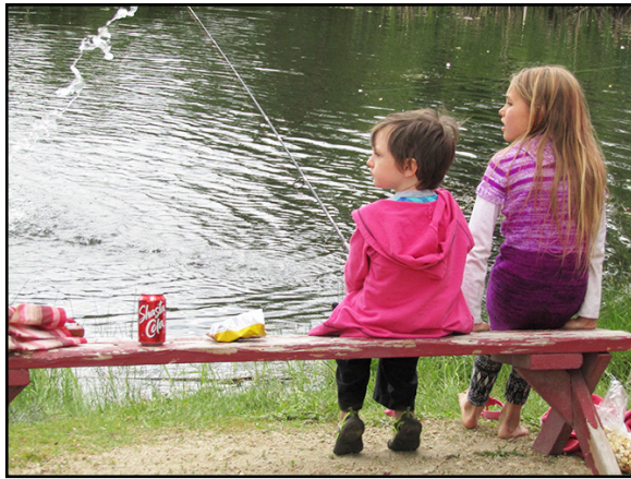
Fishing patiently all day.