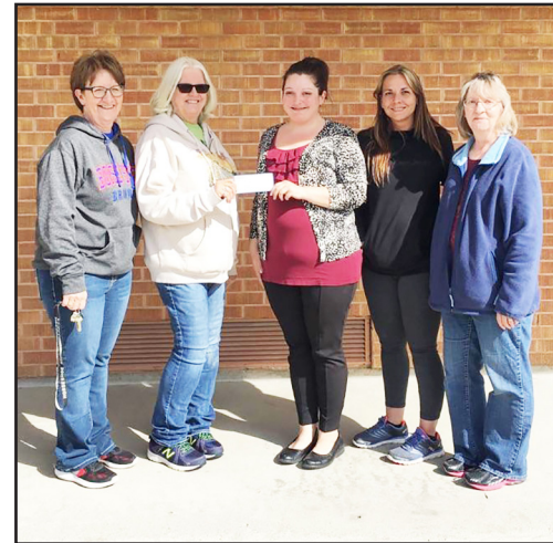
HSB Women's Club Members present check to HSB 21st Century Community Learning Center.