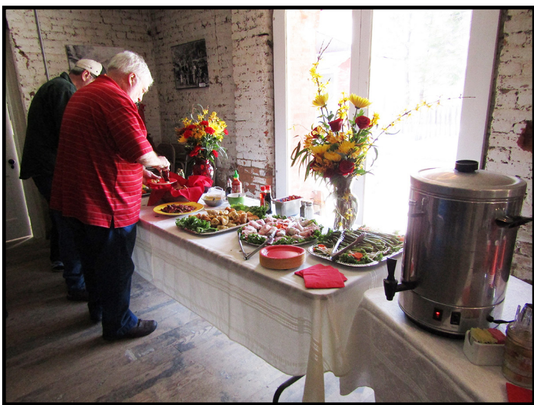
A lovely table was set up with fine Chinese cuisine, made special, by Trudy's Kitchen. Over 50 people came to support and attend this event.