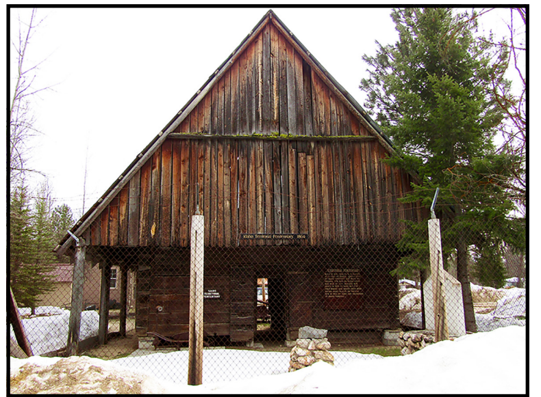
Idaho's Territorial Prison, built in 1864, still stands as a testament in Idaho City.