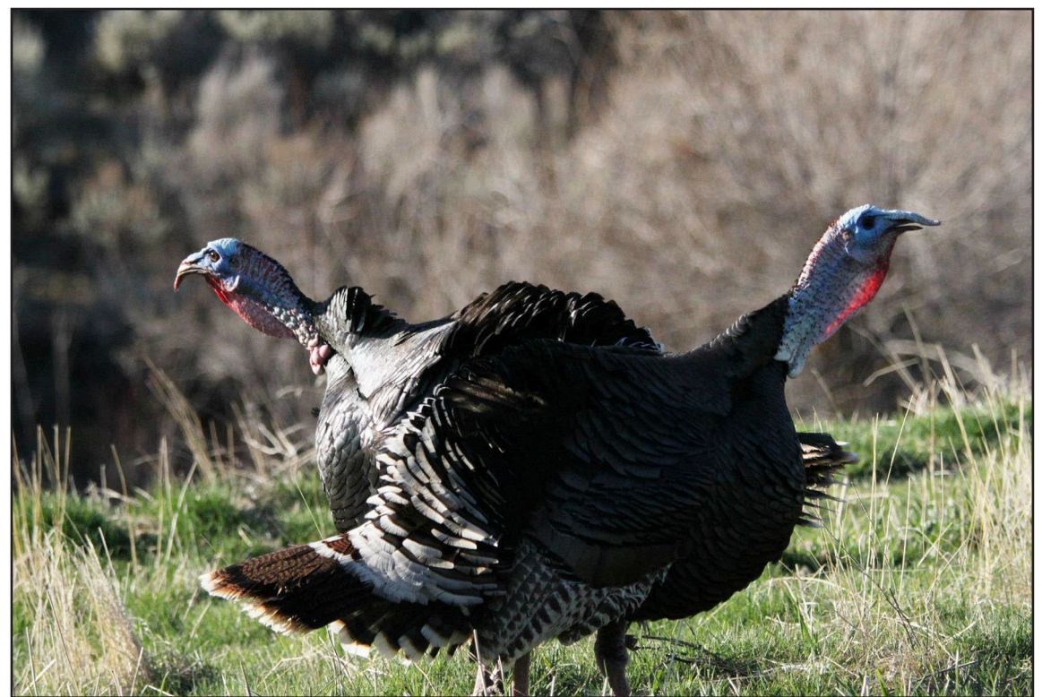
Wild turkey season is in full swing,