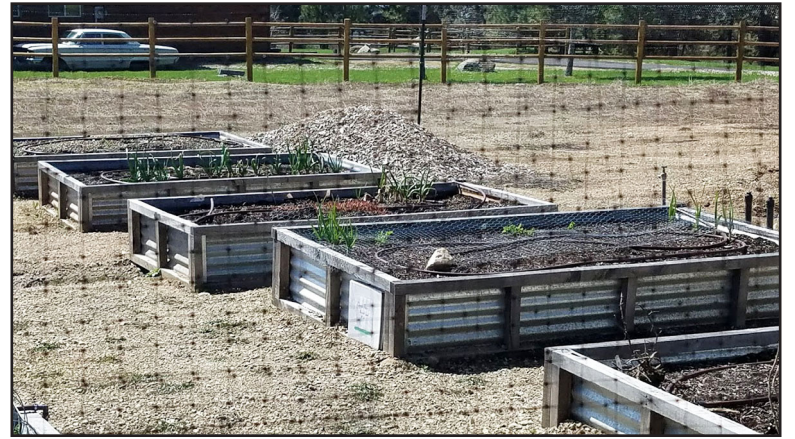
Above ground planting areas.