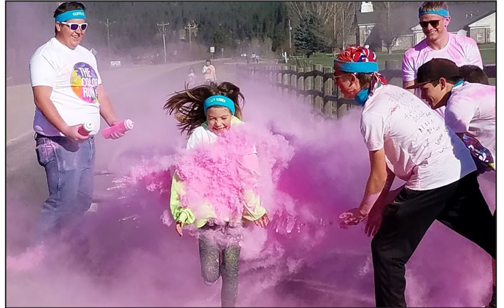
High school students knew how to dispense plenty of color on the runner. (above photo)

Written by Janet Juroch Garden Valley -- The Garden Valley Color Run 2017 was a success with at least 30 participants who were ready for getting colored as they ran or walked the 2 mile course. This was a fundraiser for the GV High School track team. With the proceeds they were able to purchase an instant runway for the jump pit. The race started at Weilmunster Park and there were several stations to pass through where colored chalk was dispersed on the participants. The race ended at the Outreach Center where there snacks for everyone. There were many different ages and groups participating and they all seemed to want this fundraising event to happen every year. Jenn Van Dyk, Track Coach and event organizer, especially wanted to thank Keith Hughes for providing all the boxes of the powdered colors and the OC for the water and snacks at the end.