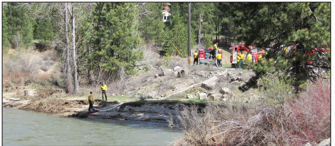
Wilderness Ranch Volunteer Fire Dept. training on April 15, 2017, included drafting water from Mores Creek.