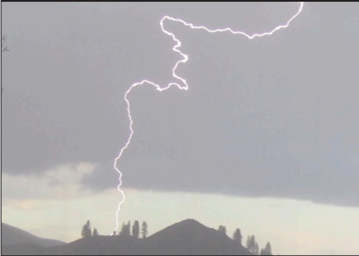
Lightning storm on April 18th, 2017.