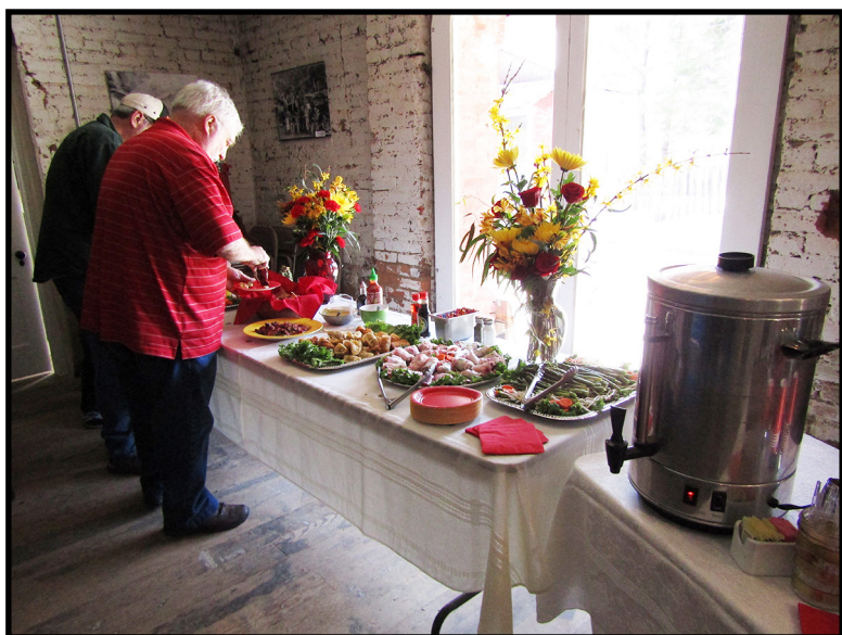
A lovely table was set up with fine Chinese cuisine, made special, by Trudy's Kitchen. Over 50 people came to support and attend this event.