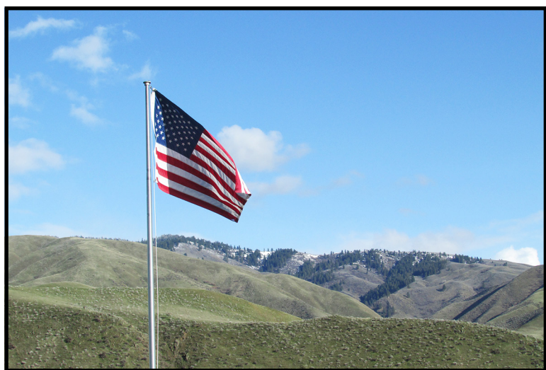
The Stars & Stripes are flown proudly on a Horseshoe Bend hillside.