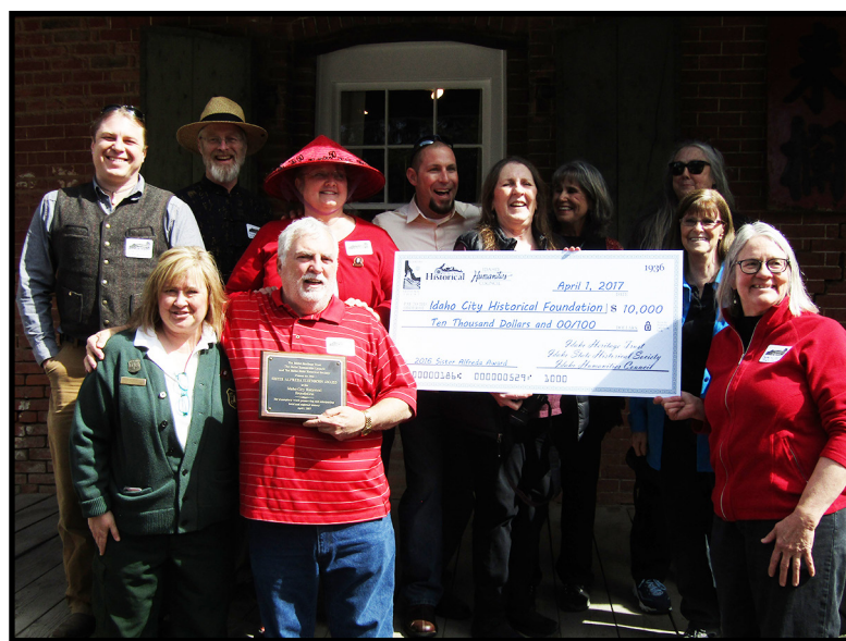
ICHF Board Members, 2017.