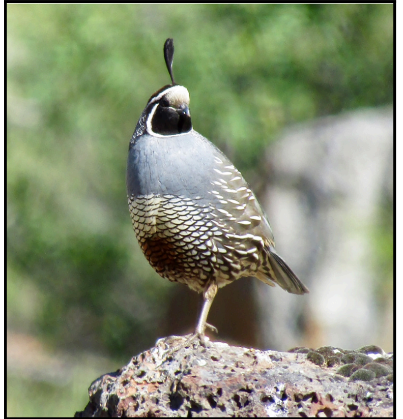
Quail and other birds abound in anticipation of warmer weather.