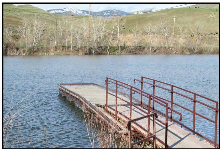
Enjoy a sunny day at Mill Pond in Horseshoe Bend.