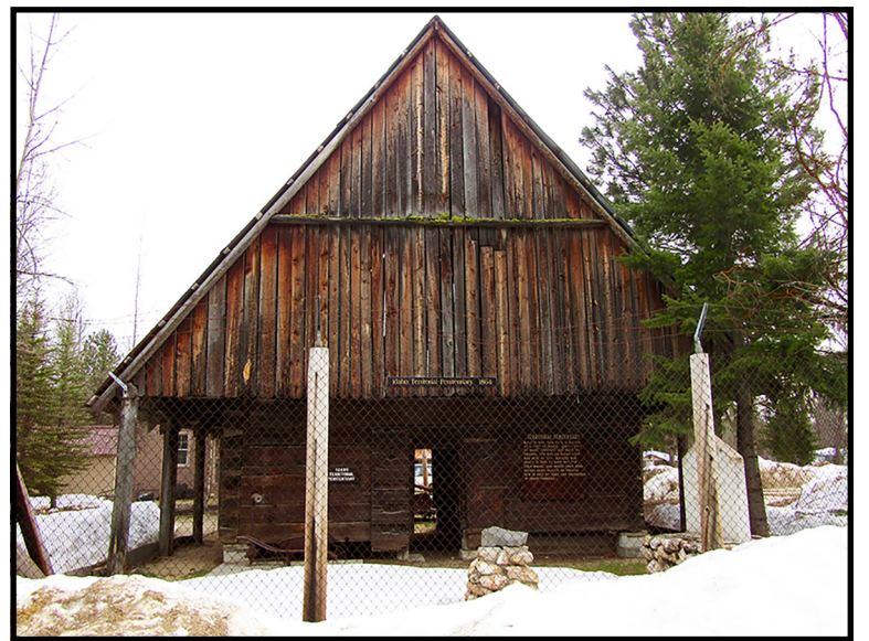
Idaho's Territorial Prison, built in 1864, and still stands as a testament in Idaho City.