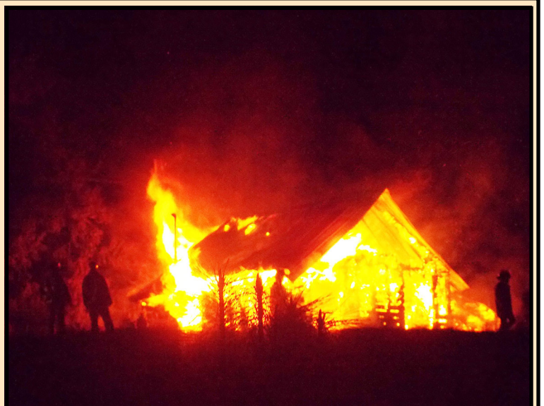
A home in Holcomb 2 subdivision, Clear Creek, burned to the ground on March 26th.

Fortunately, the single mother and her three little girls, had been down in Boise when she received that terrible phone call, telling her not to come