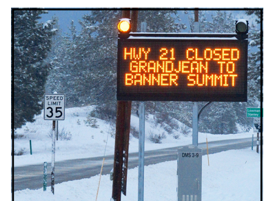
Avalanche danger closes Hwy. 21.

How to Sign Up: The enrollment is simple and does not take a lot of time. Log onto the Boise County website at http://www.boisecounty.us and click on the Sheriff link on the left side. Or you can go directly to the sheriff page at http://www.boisecounty.us/Sheriff.aspx That is where you will see the AlertSense™ link. No computer at home? Sign-up is still possible at the local libraries where they can help patrons get signed up. It only takes a minute and the system is able to provide a valuable service.