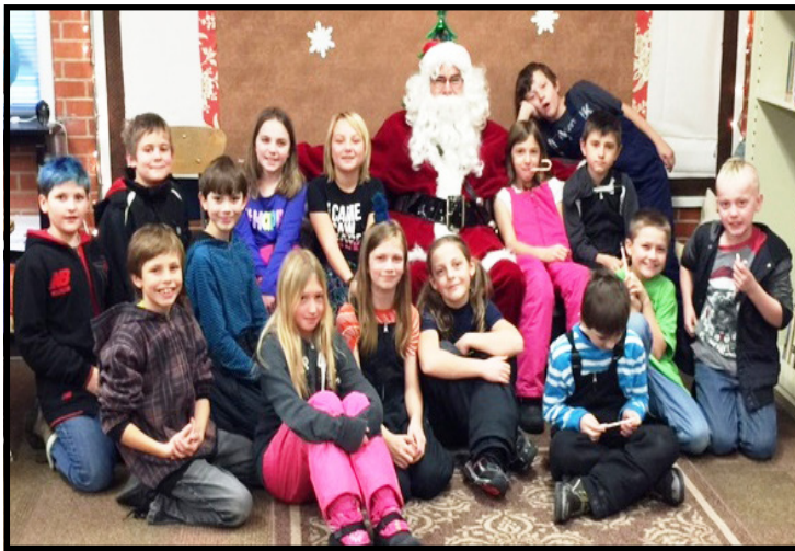
Santa's bells were jingling as he made a special stop at the Basin Elementary School on Wednesday, December 14, 2016. He read a story to the pre-school youngsters and talked to children in all of the classrooms; asking them what they wanted for Christmas and handed out candy canes to everyone.