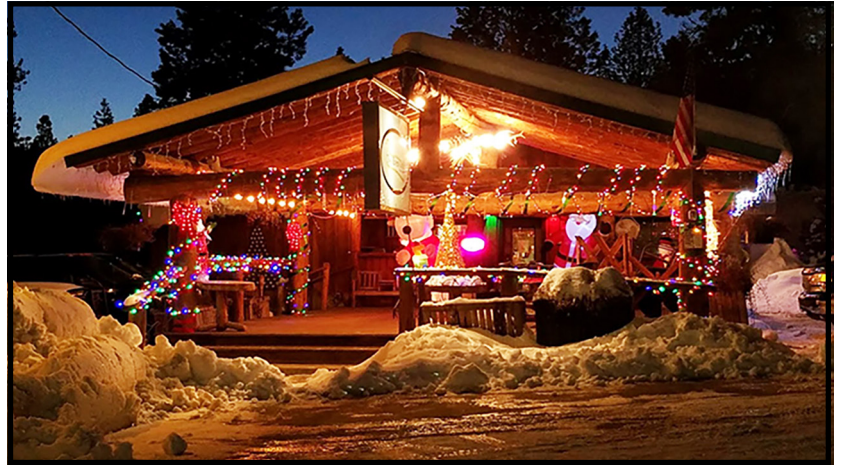
Two Rivers Grill, complete with large balloon characters takes 1st Place in this year's Christmas lighting competition, 2016.