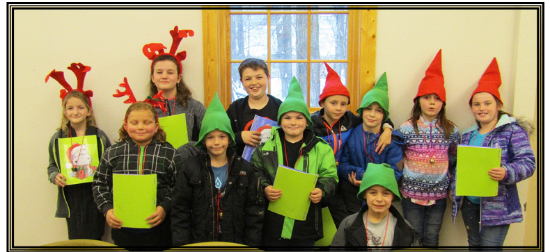
Children from the after school program at Basin Library, dressed as elves and reindeer, ventured out into the snow to carol at the county offices.