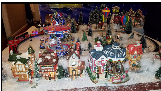
The Christmas Village at the Pelley's of GV showed hundreds of lighted houses, with trains and even a ski slope to create a town that fills a basement.