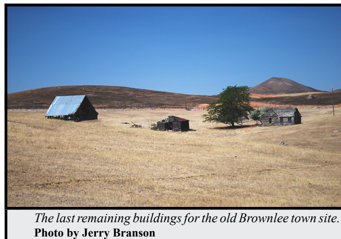
The last remaining buildings for the old Brownlee town site.

This route was used by packers from Umatilla and Walla Walla until late 1864 when the Burnt River route was secured and stagecoach travel was begun. It continued until new ferries were built on the Boise River by 1865 and the toll road was fully operable. However,