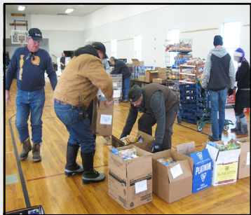
Volunteers collecting the food for one specific family.

In the last 15 months, the Boise Food Bank has provided 37 tons of food to the Community Food Pantry that has been organized and distributed by local volunteers, the majority over 60. The Pantry distributes food twice a month at the school annex.