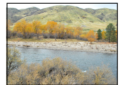
Frenchman's Island on the Payette at Gardena