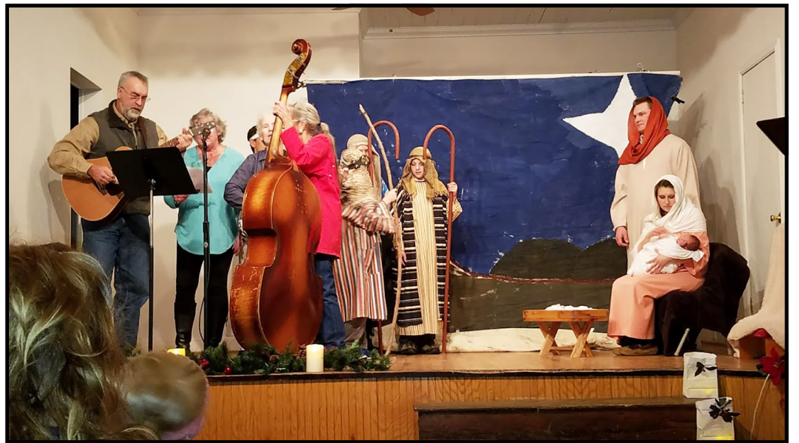
A performance of The Walk to Bethlehem In Crouch delivered the Christmas Message in song and prose.

Lighting and other activities to make more holiday memories. Others will take try their luck at snowshoeing and cross country skiing. Another good snow and the sleigh rides could start up, also. December does not slow down too much around Garden Valley.