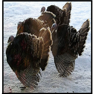
Turkey toms all fluffed up in the snow.