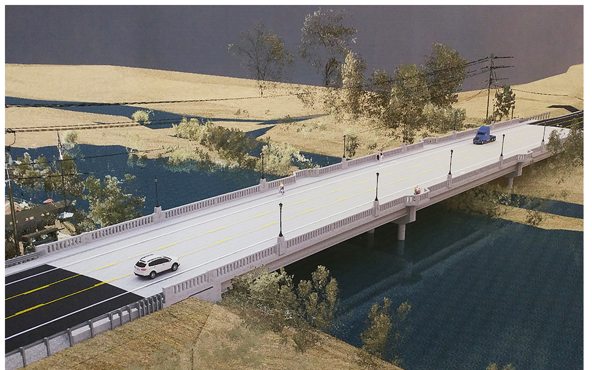
Artist's rendition of the new Hwy. 55 bridge. It has an expected project start date of fall of 2017, when the water level is low.

Once the new 2-lane is completed and traffic routed onto it, the current, 1934 bridge will be demolished. The rest of the new 3-lane will then be built where the old bridge was. When completed, a brand new 3-lane bridge, with street lights, bump outs for fishing and sidewalks will exist.