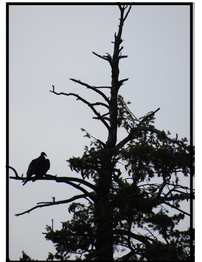
A vulture takes refuge in the branches of a dying pine tree (most likely from bark beetle infestation).

The Pine Flats Campground and hot springs area will remain closed for public safety until further notice as part of the Version #11 Pioneer Fire Closure Area. For all Boise National Forest closures visit: https://origin-fs.fs.usda.gov/alerts/boise/alerts-notices