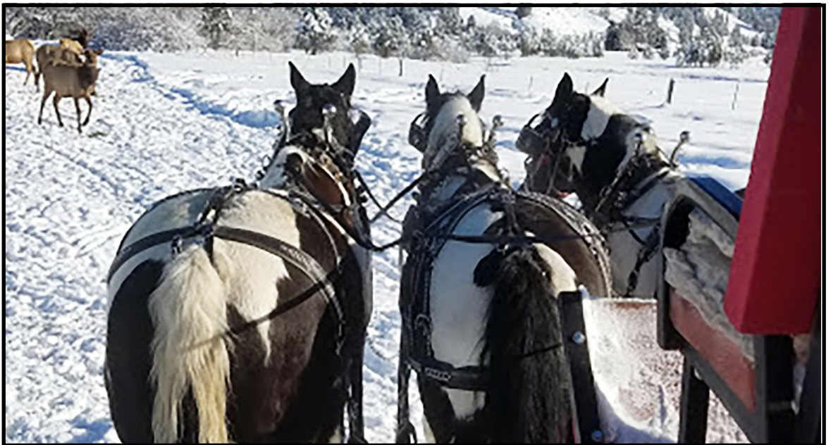
Cisco, Ruckus and Pancho draft team pulls the sleigh closer to the elk waiting along the snow covered field.

For more information on these sleigh rides, check out Idaho Sleigh Rides on Facebook or go to www.idaho-sleighrides.com or call 208-462-3416 for reservations. Whether with a big group or a nice romantic ride for two, Idaho Sleigh Rides can help. Open seven days a week. Call to book a ride.