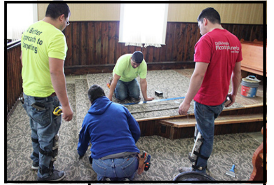
The crew with BCI have been working diligently, on the weekend, to have the courthouse remodel completed by the end of the month.